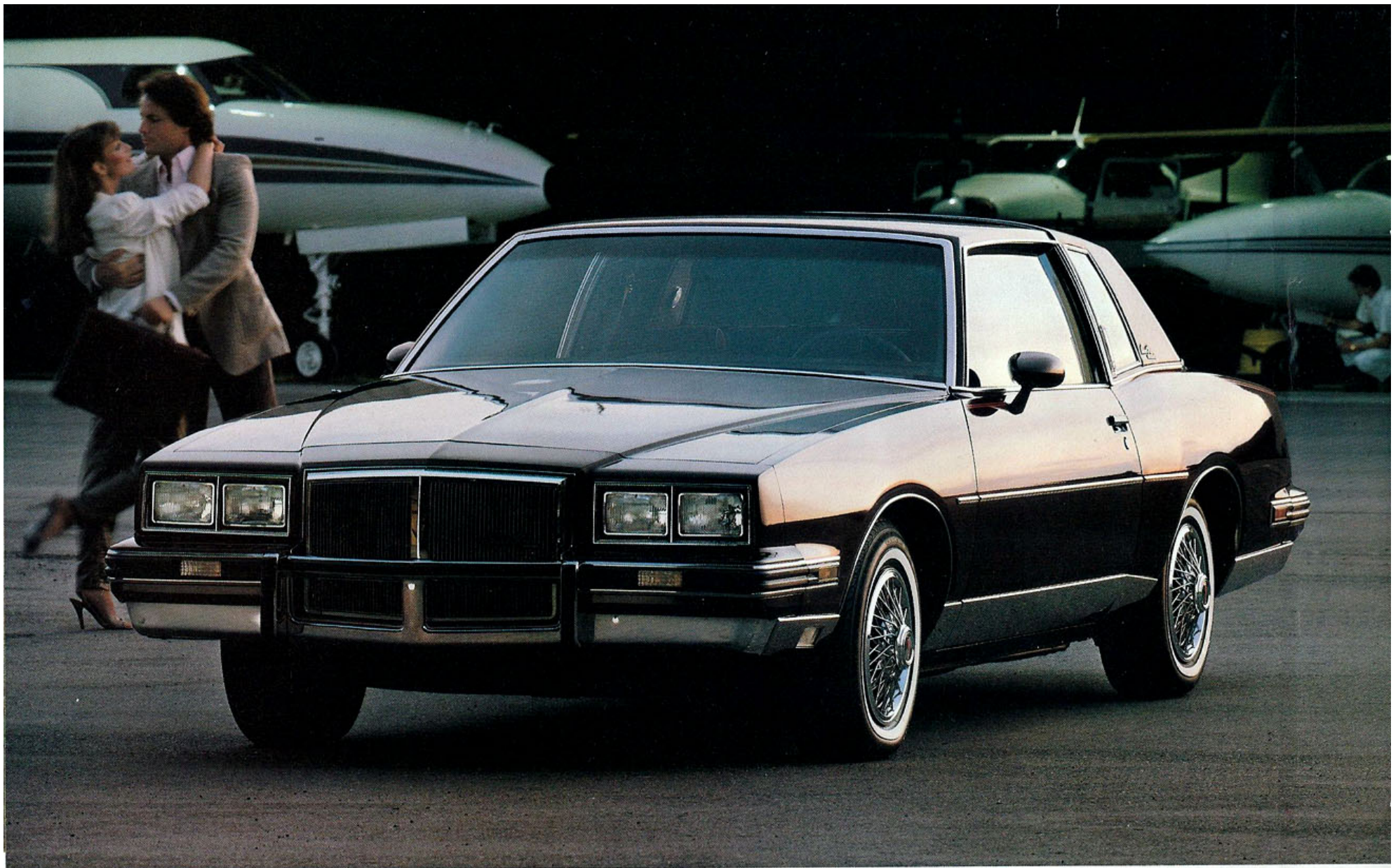
Grand Prix Brougham.