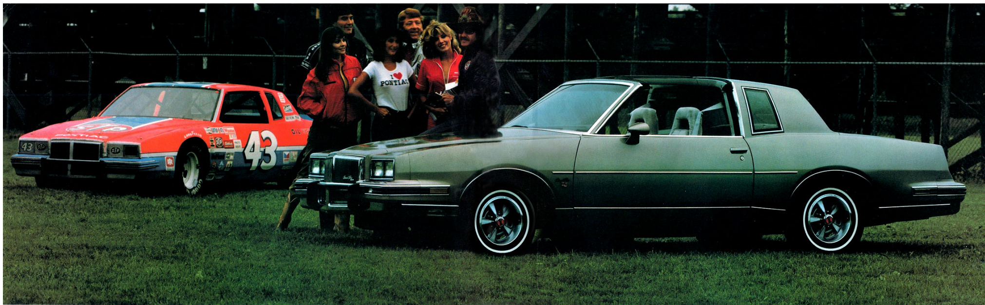
Grand Prix LJ

Its name is legend. Its standard of excellence expected. Its level of excitement self-evident. Grand Prix is a car that doesn't need flash to fire excitement. And for 1983, the excitement is yours to enjoy in three ways: Grand Prix, Grand Prix LJ and Grand Prix Brougham.