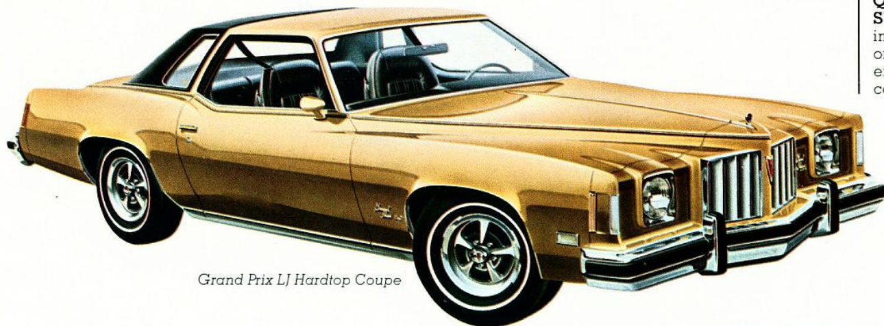
Grand Prix LJ Hardtop Coupe

This literature is applicable only to 1975 General Motors vehicles equipped with a Catalytic Converter.