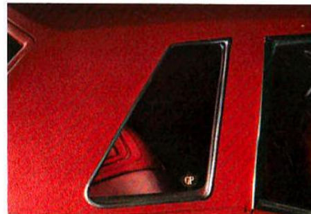
Grand Prix rear quarter window.