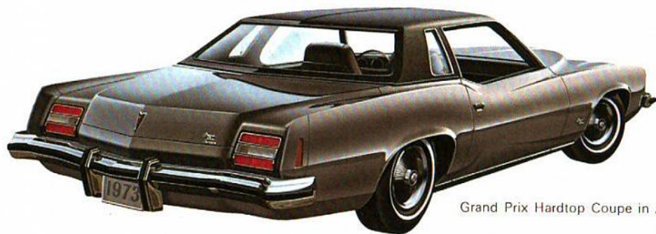
Grand Prix Hardtop Coupe in Ascot Silver.

New improved front and rear bumpers. Wide rocker panel moldings with black accents. Formal roof line with monogrammed rear quarter windows. Longer doors for easier entry. Deluxe wheel covers. Windshield radio antenna. Concealed wipers. Bright moldings on roof, windshield, quarter window, rear window, windowsill, hood rear edge and wheel openings.