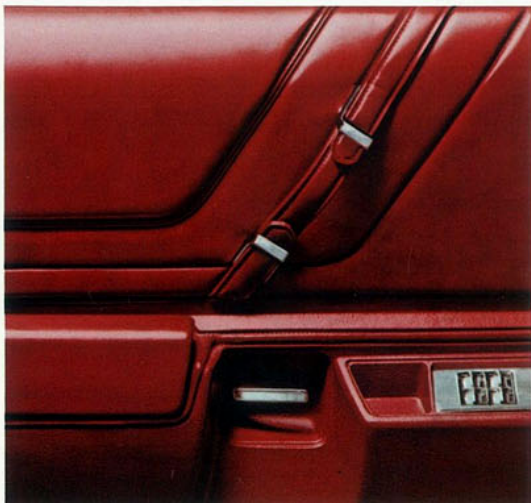
Door panel trimmed in Morrokide with standard assist strap.

We think Grand Am is one of the purest, no-compromise cars to come out of the U.S. That's Pontiac's way with cars.