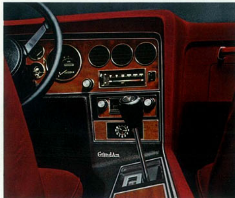
Instrument panel and console inlaid with African crossfire mahogany.