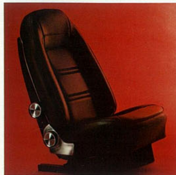
New reclining deep-contoured bucket seat with adjustable lower back support.