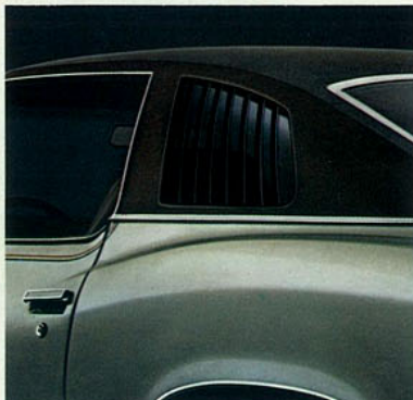
Grand Am louvered rear quarter window.

Pontiac Motor Division, General Motors Corporation, One Pontiac Plaza, Pontiac, Michigan 48053.