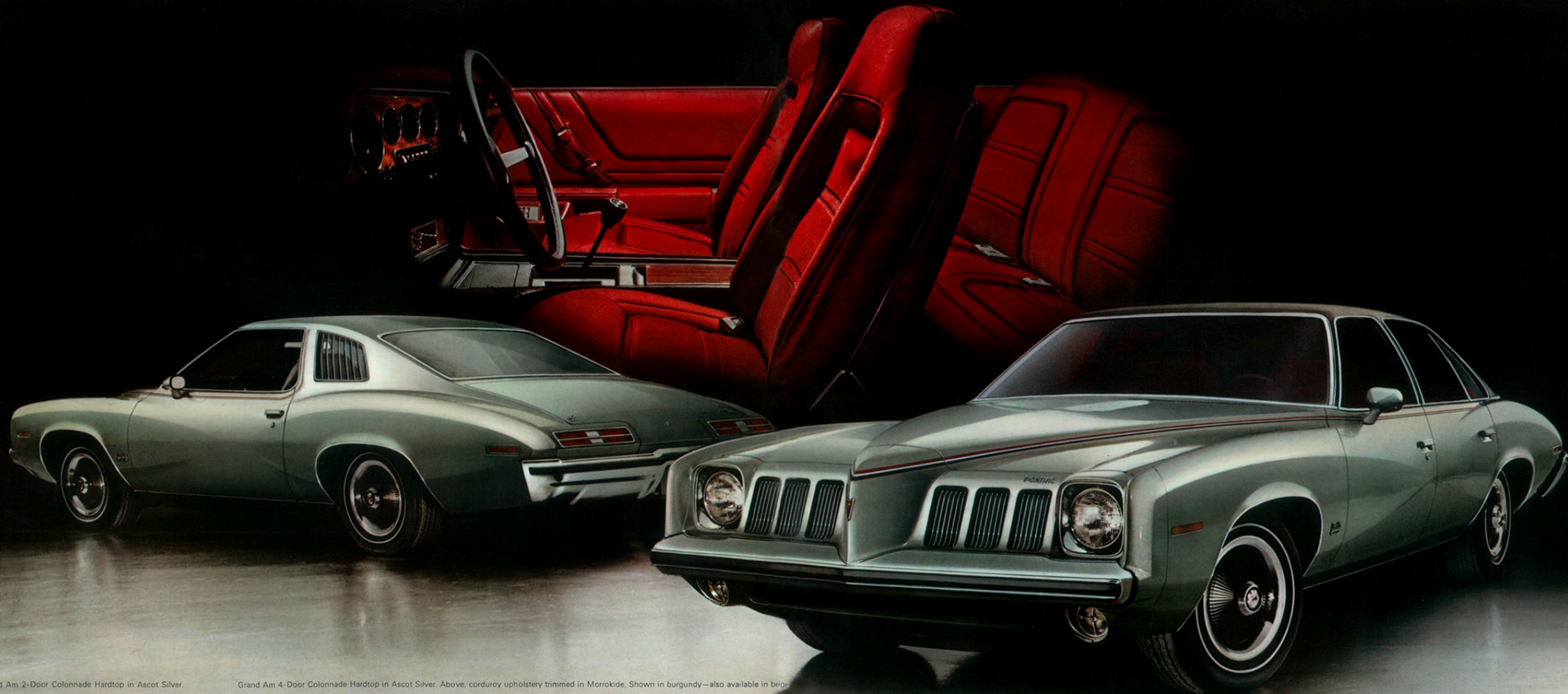
Grand Am 2-Door Colonnade Hardtop in Ascot Silver.