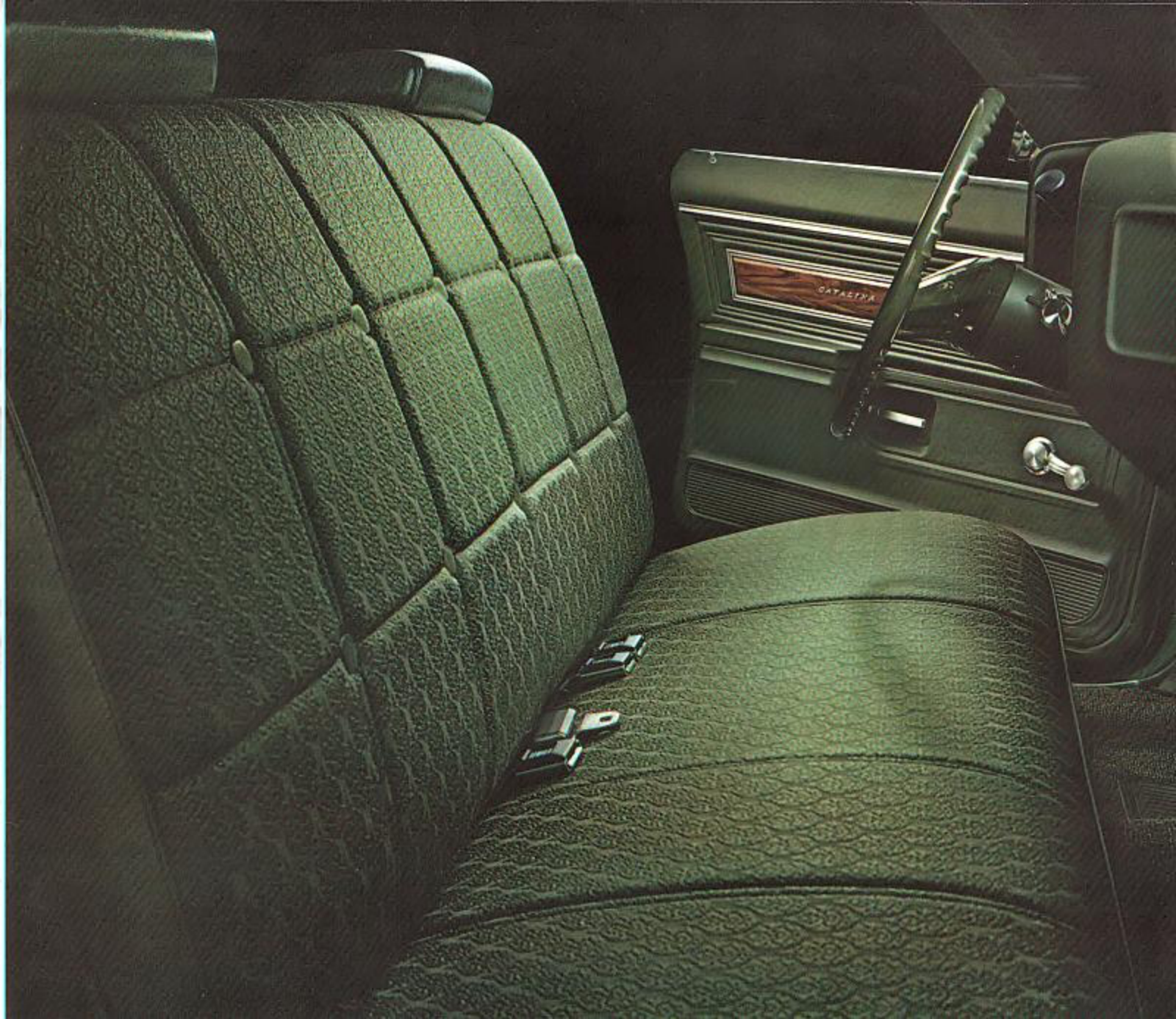
Cloth upholstery trimmed in Morrokide. Shown in green—also available in blue, black and beige.