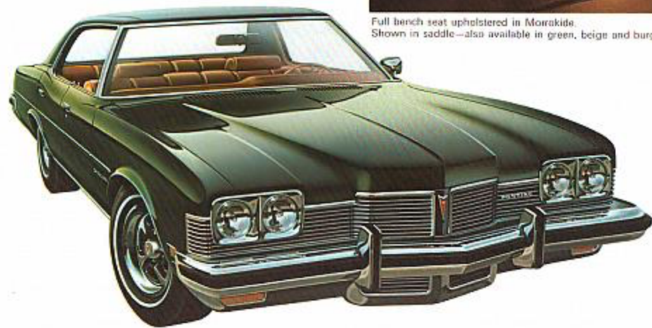
Catalina 4-Door Hardtop in Brewster Green.