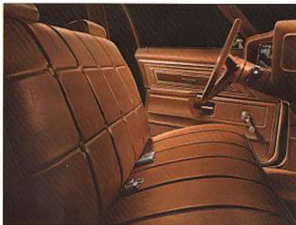
Full bench seat upholstered in Morrokide. Shown in saddle—also available in green, beige and burgundy.

Knowing we put all that in our lowest priced full-sized car should help you understand Pontiac's way with cars. It should also help you understand why Catalina's our most popular Pontiac.