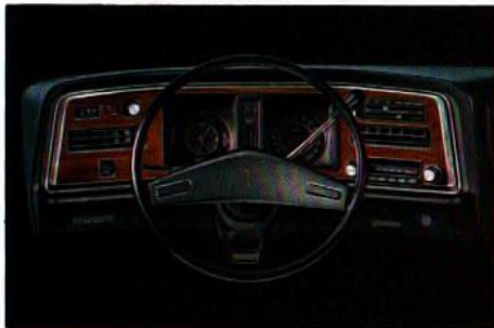
Instrument panel with American walnut wood-grain vinyl accents.

Standard engine: 350-cu.-in. 2-bbl. V-8. Available engines: 400-cu.-in. 2-bbl. V-8; 400-cu.-in. 4-bbl. V-8; 455-cu.-in. 4-bbl. V-8. Standard Transmission: Turbo Hydra-matic.