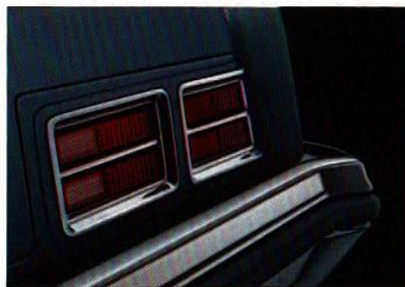
New rear tail light design protected by new improved rear bumper system.

Upgraded interior trim featuring: Bench seat with cloth-and-Morrokide trim. Full pad on seat backs. Deluxe 2-spoke steering wheel. New instrument panel cluster. Right- and left-hand ash trays. Driver's ash tray lamp. Inside hood latch release. Nylon-blend, loop-pile carpeting. Trunk compartment mat. Tilt-type inside rearview mirror. American walnut wood-grain vinyl accents on instrument panel. High-Low ventilation. Front-seat cushions of molded foam with integral springs. Molded foam front-seat backs.