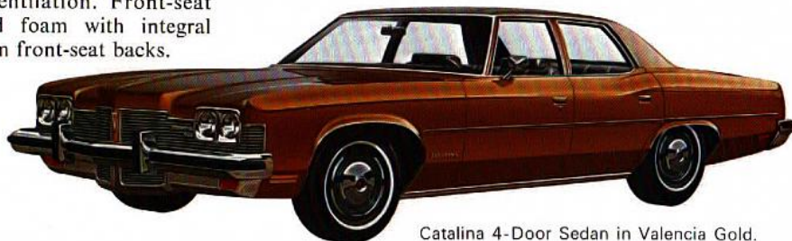
Catalina 4-Door Sedan in Valencia Gold.

Variable-ratio power steering. Power brakes with front discs/rear drums. G78—15 black sidewall glass-belted tires. 4-wheel, coil-spring suspension. Computer-selected springs. Improved body mount system. Added acoustical insulation. New engine mount insulation.