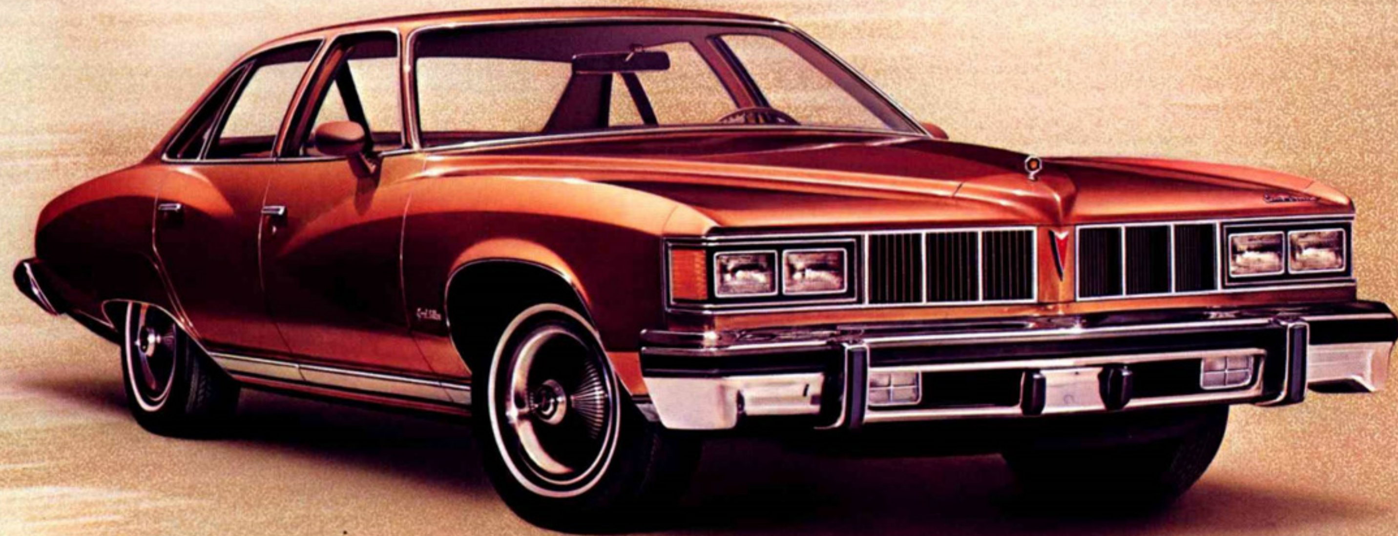
Grand LeMans 4-Door Hardtop Sedan.

Grand LeMans elegance doesn't end with a stylish exterior. There's plenty more inside to set this Pontiac apart from the crowd. Like a choice of either a full-width notchback or contoured bucket seats. To complement other fine features. Like padded upper door panels and rosewood vinyl accents on the cockpit-like instrument panel. A custom cushion steering wheel with a convenient column-mounted dimmer switch. And an electric clock.