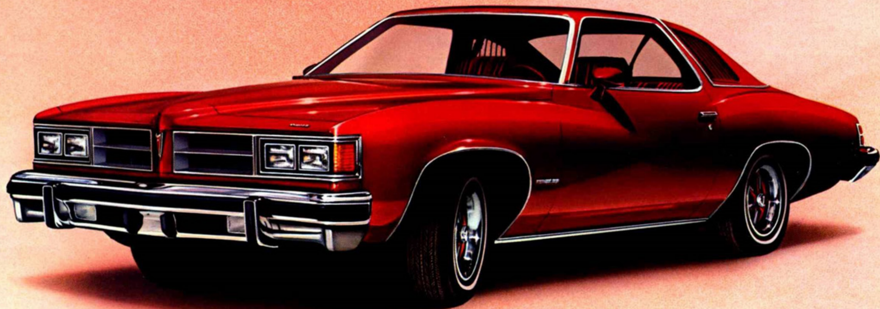
LeMans Sport Coupe 2-Door Hardtop Coupe.

Or choose the formal rear quarter window instead, if your idea of sporty follows along more traditional lines.