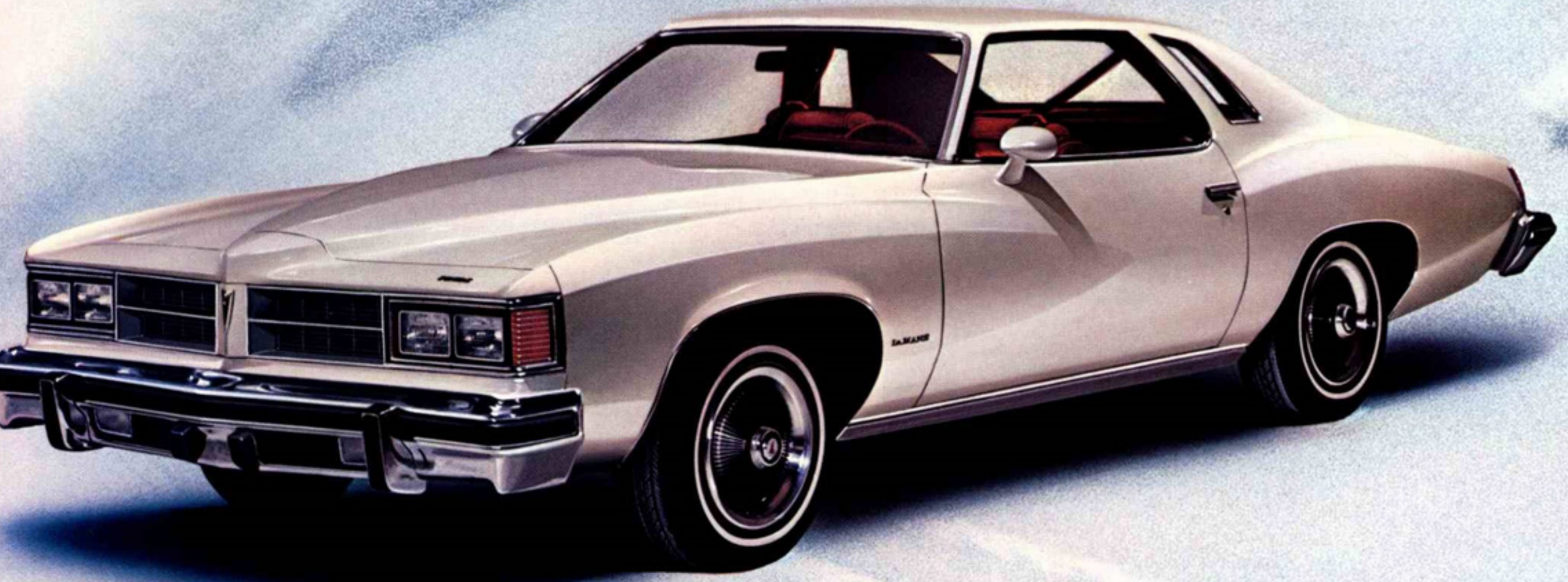
LeMans 2-Door Hardtop Coupe.