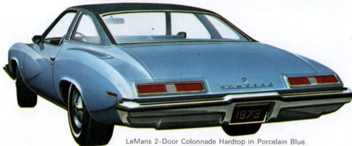
LeMans 2-Door Colonnade Hardtop in Porcelain Blue.

blackwall tires, power steering, firm shocks, 15 x 7" wheels and large front and rear stabilizer bars. Firm Ride Package includes firm shocks and high rate springs. Decor Group includes wheel opening moldings, custom pedal trim plates, Deluxe wheel covers, Custom Cushion steering wheel, and bright molding on hood rear edge and windowsills. Sunroof Option (2-door only) manually operated or power operated.