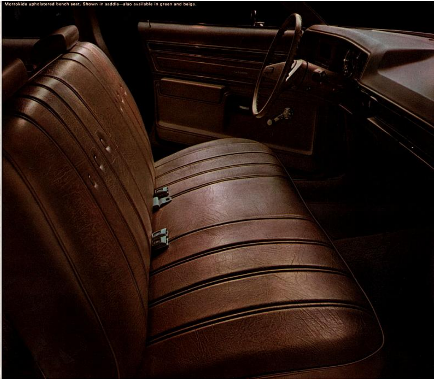
Morrokide upholstered bench seat. Shown in saddle—also available in green and beige.