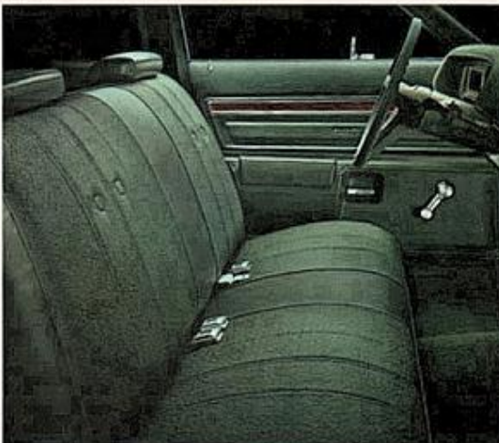
Cloth and Morrokide interior. Shown in green—also available in blue and beige.

1973 LeMans. It's nice to know that a car with so much going for it is so affordable. Because we have a way with cars.