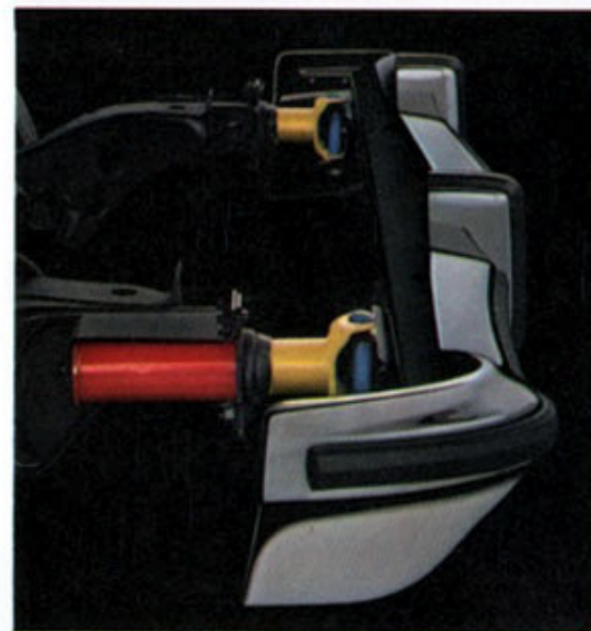
New improved front bumper system.

New improved front and rear bumpers. Fixed rear quarter windows. Windshield radio antenna. Concealed wipers. Frameless door glass. Standard hubcaps.