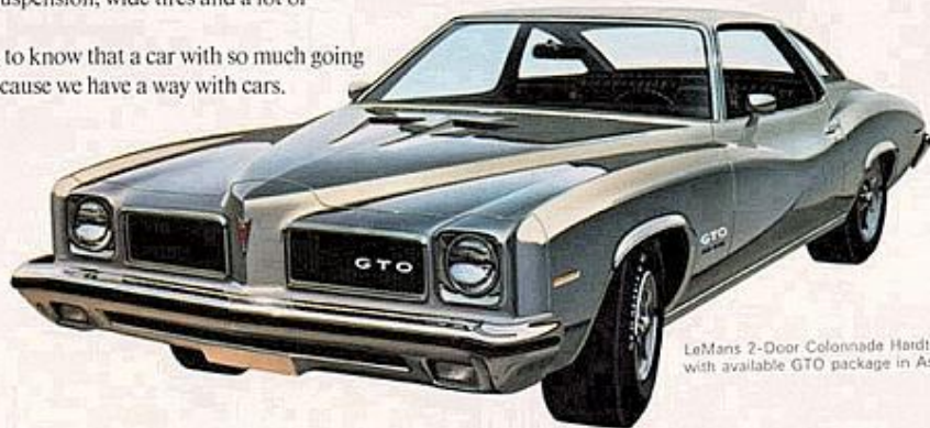
LeMans 2-Door Colonnade Hardtop with available GTO package in Ascot Silver.