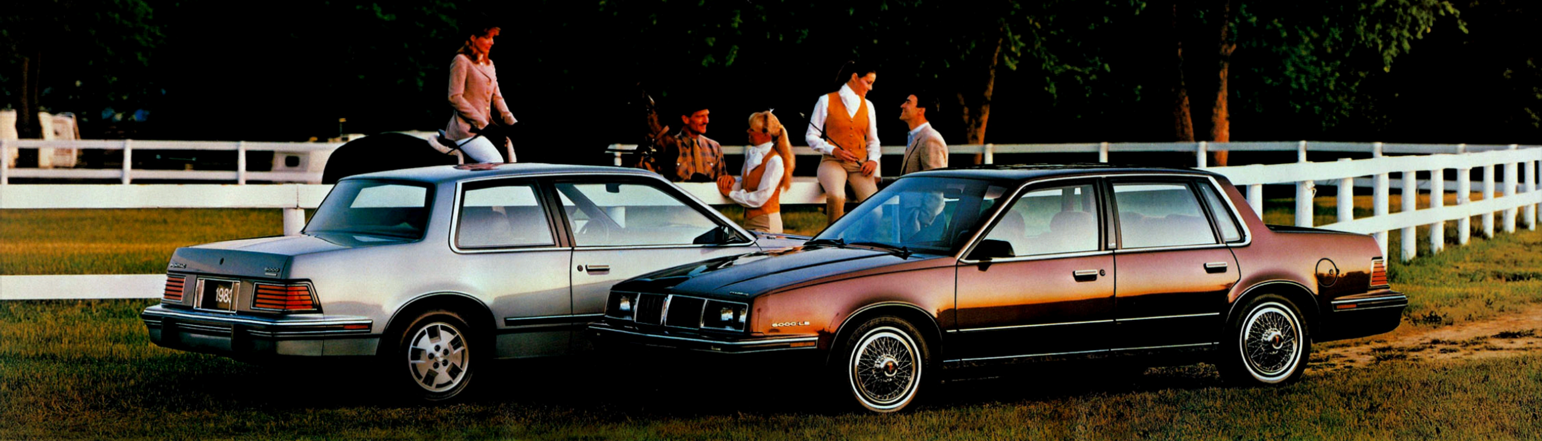
Pontiac 6000 Coupe

PONTIAC 6000. In just one year, Pontiac 6000 has established itself as one of the most exciting new cars in Pontiac's history.