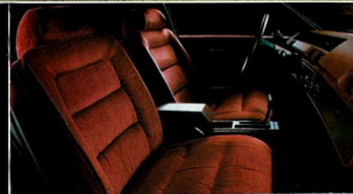
Pontiac 6000 LE Sedan

available 4.3 litre V-6 diesel, offer the practical performance you need everyday. But for an extra kick, order the available 2.8 litre V-6.