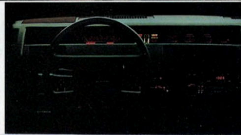
Pontiac 6000 STE Instrument panel

The result is nothing short of a driving sensation. Its steering is impeccably precise, allowing you to exploit its agile reflexes to the fullest. And