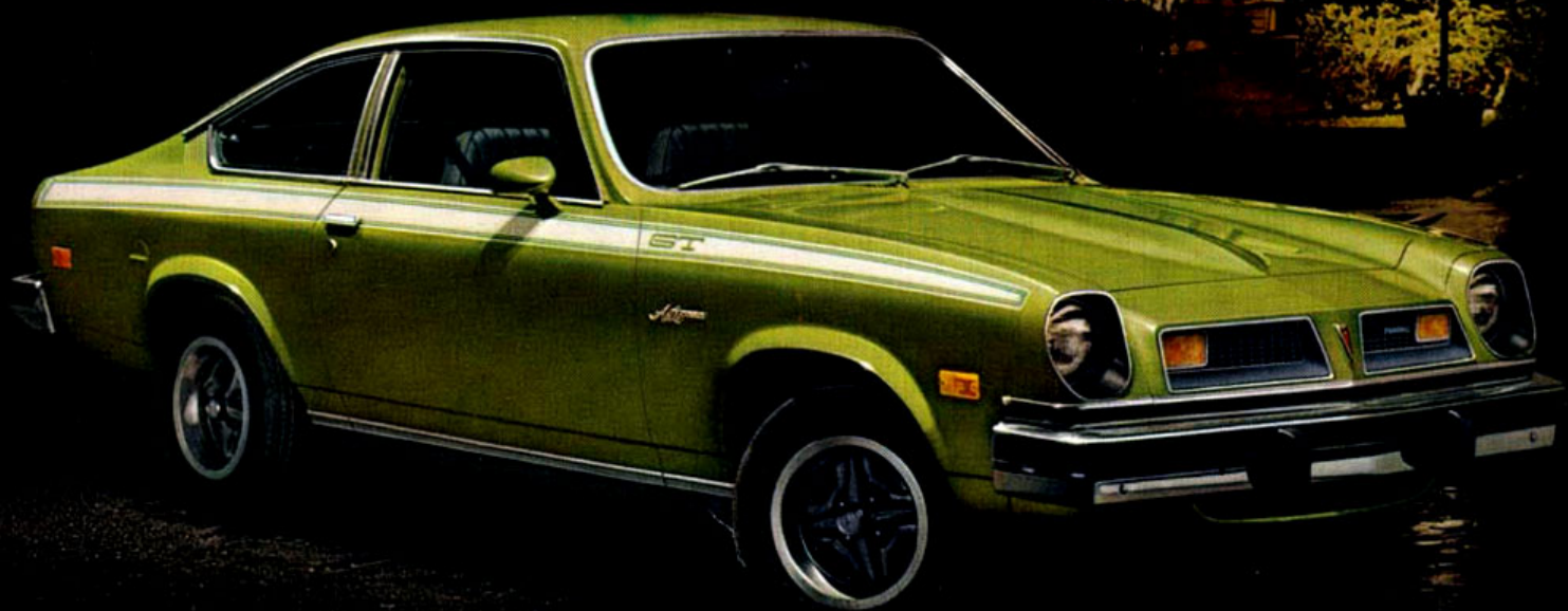
Astre GT Hatchback Coupe.