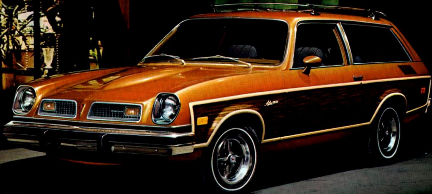
Astre SJ Safari Wagon.