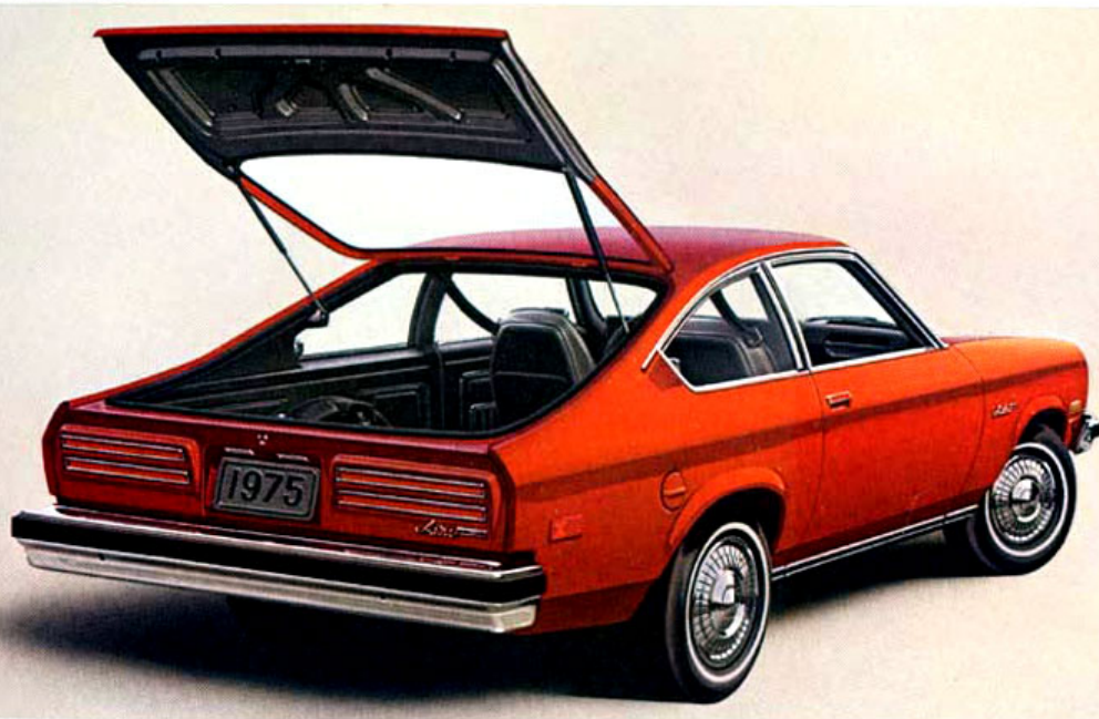
Astre Hatchback Coupe. The hatch pops up, the rear seat folds down to give you lots of easy-to-load cargo space.

Astre SJ. Now, everybody knows a subcompact can't be a luxury car. But our new Astre SJ might be cause for some new thinking.