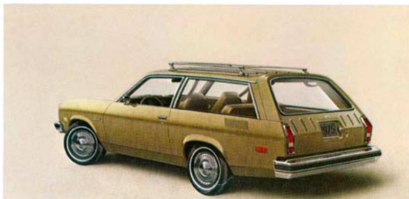
Astre Safari Wagon.

Front and rear stabilizer bars, 2-bbl. carburetion, a quick rear