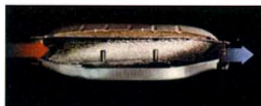
The catalytic converter—part of Pontiac's Maximum Mileage System—helps give you good mileage.

Tilt steering wheel. Power steering. Custom air conditioning. Woodgrain body siding. Formula steering wheel. Limited slip axle. Rally gauges. Electric rear window defroster. Safari rear window wind deflector. Rally and Rally III wheels. Cordova vinyl top. And much more.