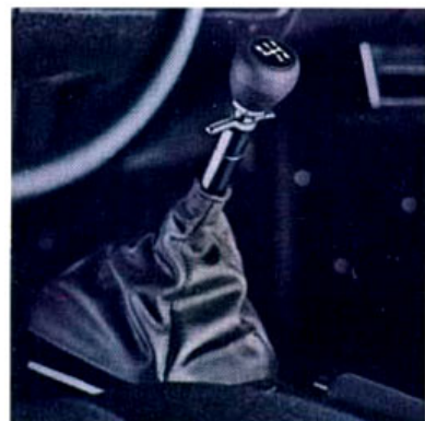
It wouldn't be a Pontiac if you couldn't get a 4-speed.

Special cloth and Morrokide upholstery and interior trim. Rally gauges, including tachometer, water temperature, voltmeter and electric clock. Custom cushion steering wheel.