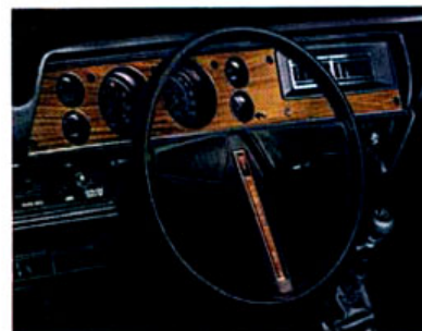
Astre SJ has full rally instrumentation.