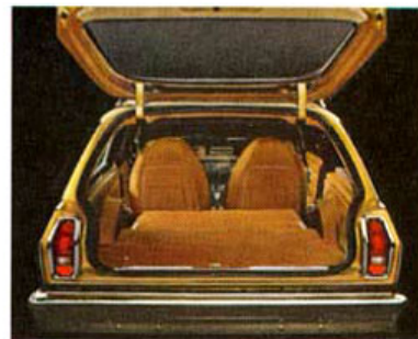
Astre Safari's 46-cu.-ft. cargo area.

In short, a standard interior that looks like extra cost.