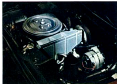
Economy starts here. Astre's overhead cam engine.