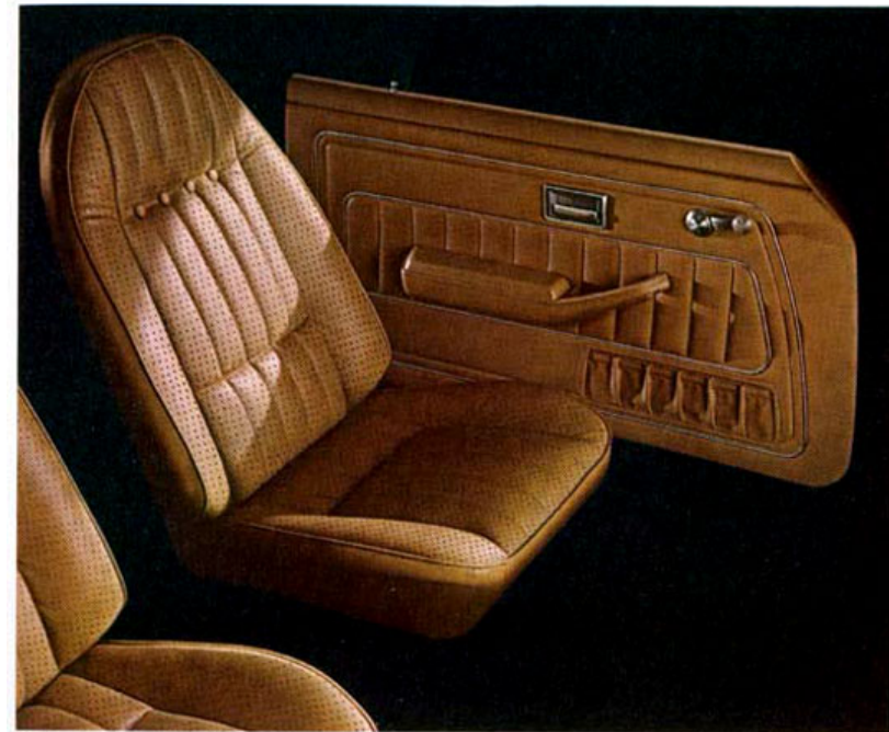
Astre's all-Morrokide upholstery. Shown in saddle—also available in black, burgundy, sandstone and white.

A custom cushion steering wheel, electric clock, tachometer and rally gauges are set off by the look of African crossfire mahogany on the instrument panel.