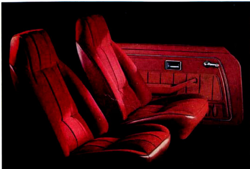
Believe it or not, this is the standard interior of Astre SJ. Cloth and Morrokide buckets shown in burgundy—also available in blue and black.

There are lots of solid reasons for buying a subcompact these days. The way they seem to scamper through heavy traffic. Zap into the tightest parking spots. Hold a lot of gear in a little space. And maybe most important, the way they manage to get all those miles out of a gallon of gas.