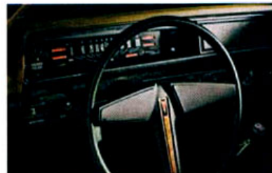
Astre has the look of African crossfire mahogany.

Until now, you couldn't get a Pontiac Astre.