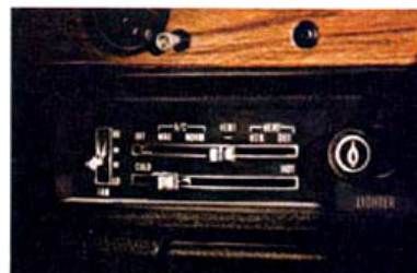
You can even order air on an Astre.

Fuel tank—16.0 gals. Cooling system—7.6 qts. Oil, less filter refill—3.0 qts.