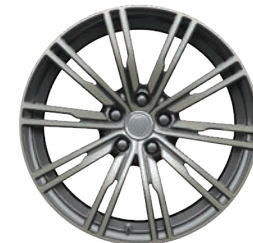
22" Forged Multi-Spoke