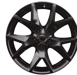
22" Dune Twist Midnight Chrome