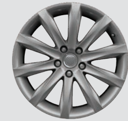
21" Diamond Facet