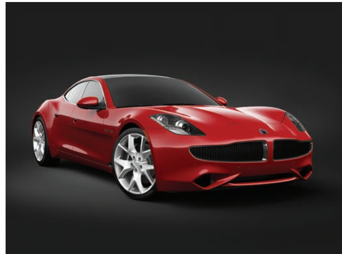
Corona Del Sol