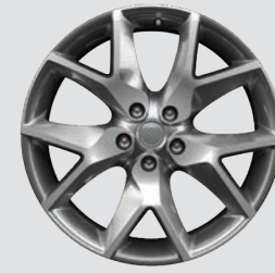
22" Dune Twist