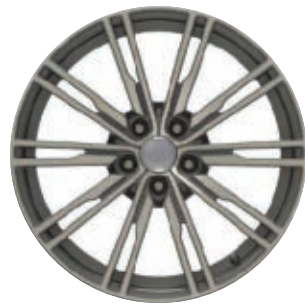
22" FORGED SPUR