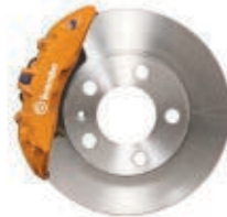
BURNT ORANGE CALIPER