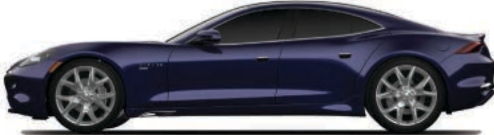
BODEGA BAY BLUE