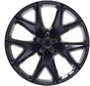
22" DUNE TWIST MIDNIGHT