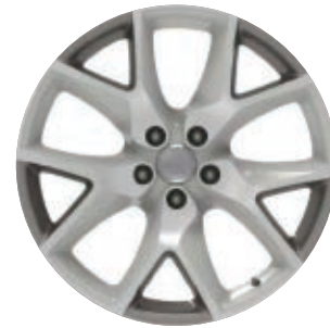
22" DUNE TWIST SILVER