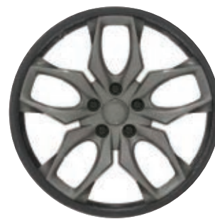
22" CARBON SHADOW