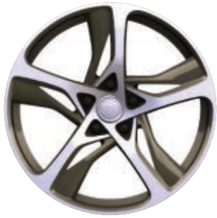
21" TWIN FORGED