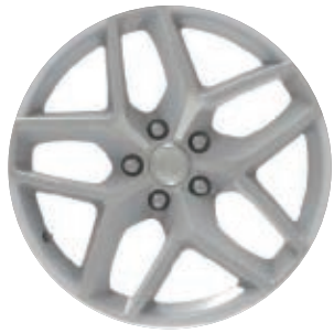
21" CASCADE SILVER