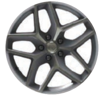
21" CASCADE DUSK