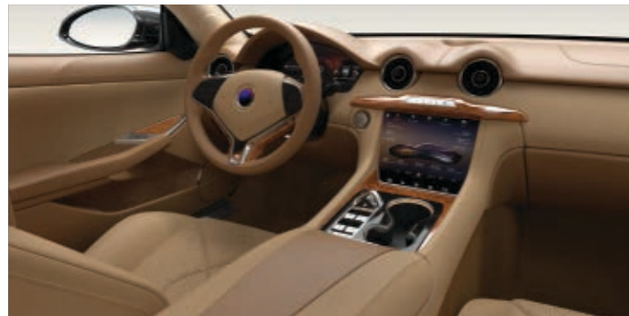
CRYSTAL COVE - available in solid or perforated leather