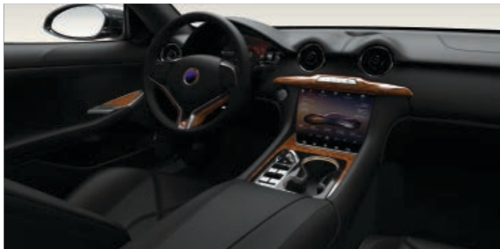
PALISADES - available in solid or perforated leather