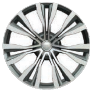
22" CHRONO FORGED