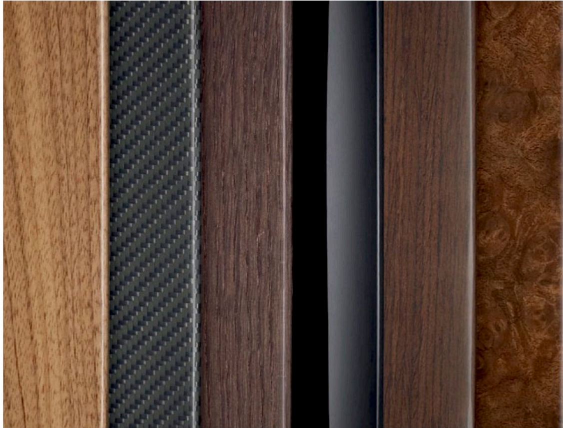
Satin American Walnut