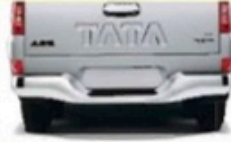
CHROME REAR NUDGE GUARD