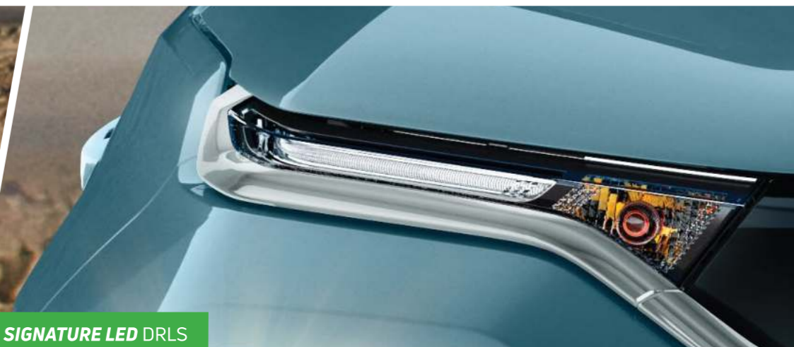
SIGNATURE LED DRLS