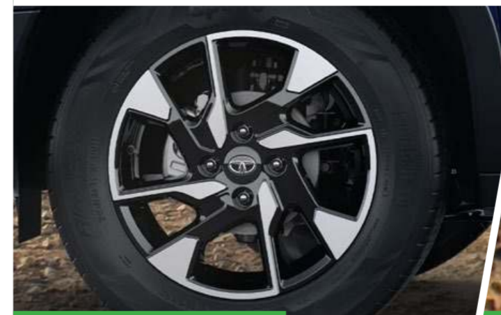
R16 DIAMOND CUT ALLOYS