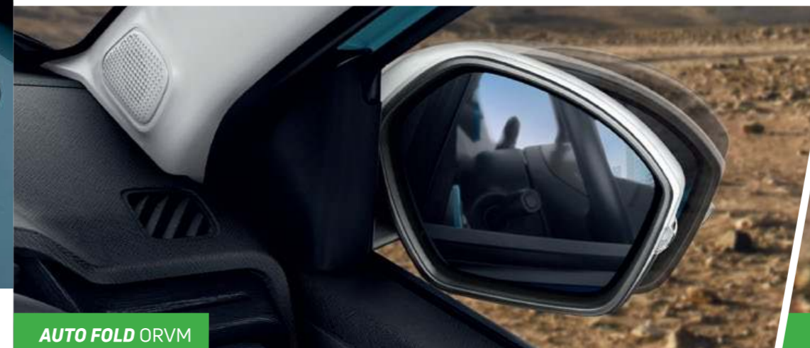
AUTO FOLD ORVM