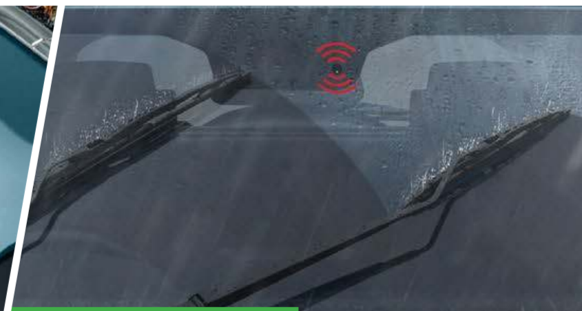
AUTO RAIN SENSING WIPERS