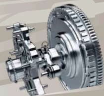
HIGH PERFORMANCE CLUTCH