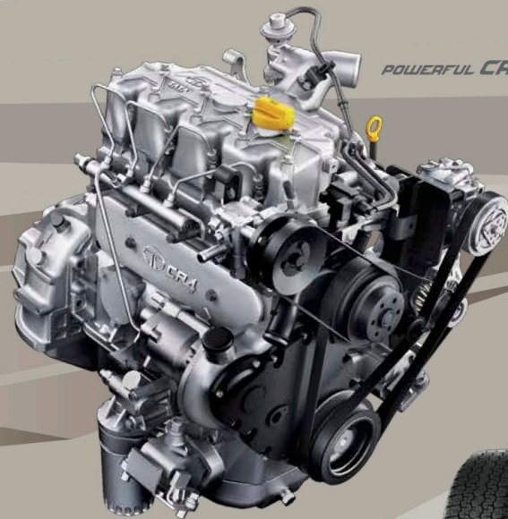
POWERFUL CR4 ENGINE