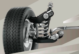
DOUBLE WISHBONE SUSPENSION