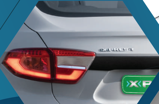
Crystal-inspired LED tail lamp