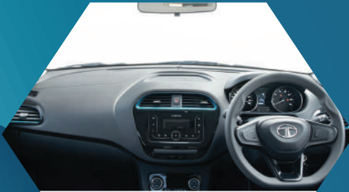
Premium black interior theme with automatic climate control