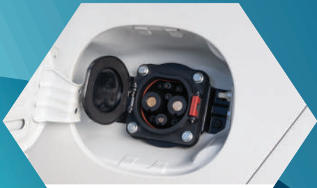
Fast charging socket