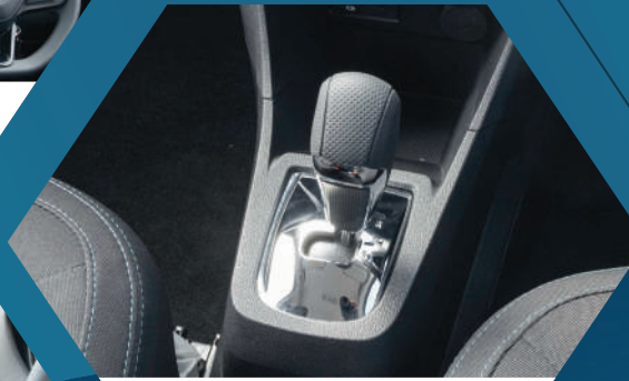
Single speed transmission with sport mode, drives like automatic