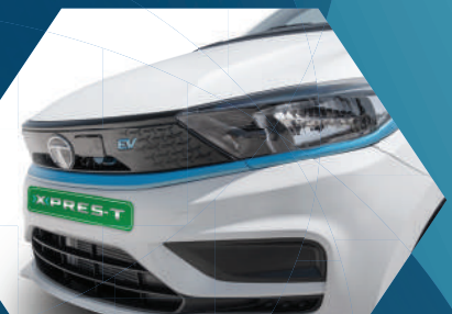
EV accent themed grille