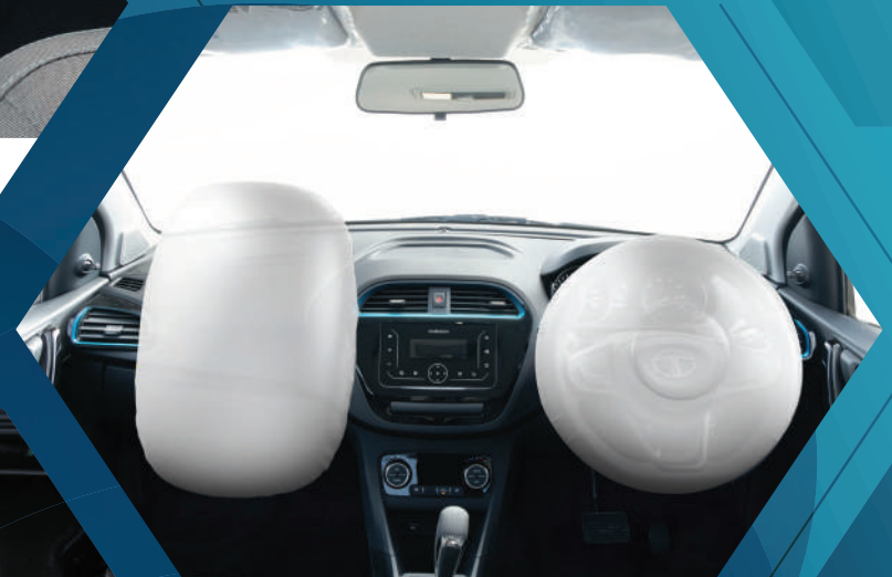
Enhanced safety with dual front airbags