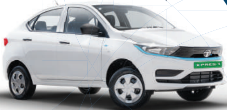
Breakfree coupe-inspired roof line