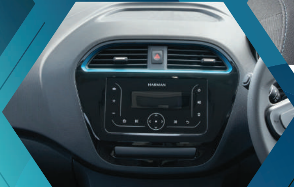
Impressive sound experience by Harman™**