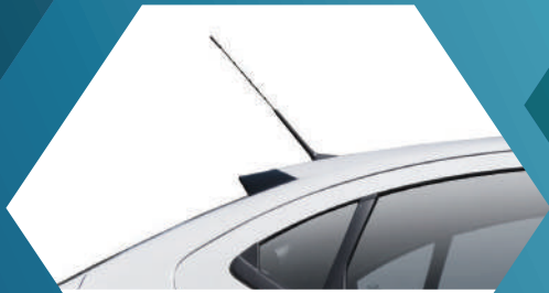
LED high mounted stop lamp