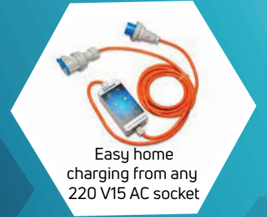
Easy home charging from any 220 V15 AC socket