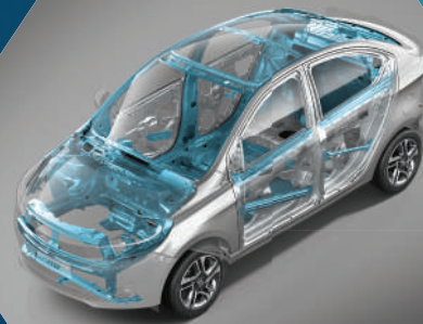
Reliable architecture with cocoon like safety cell