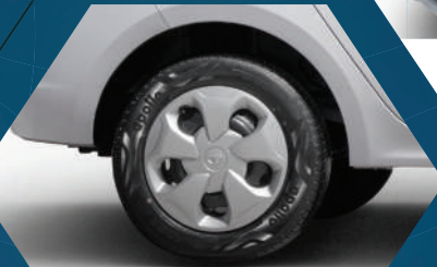
Stylish wheel rims & Stylish alloy wheel (Available in XT+ only)