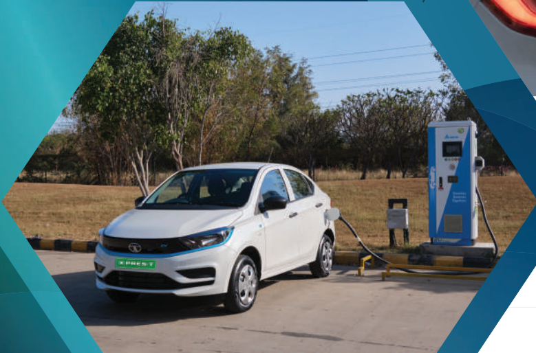
Fast charging 0 to 80% in 1 hr 50 min*