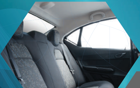
Premium fabric seats