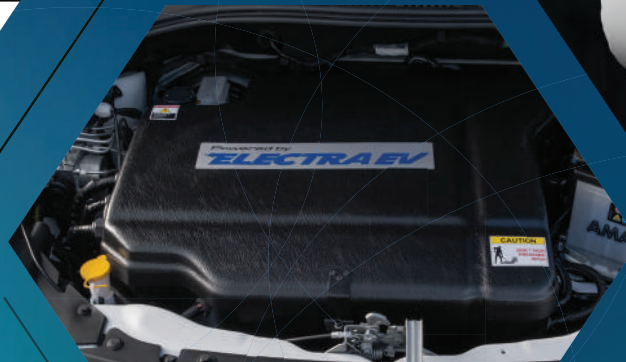
High energy density 21.5 kWh battery for greater driving range on a single charge