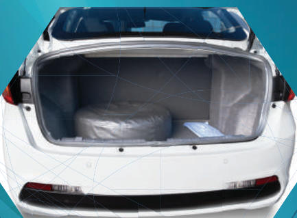
255L boot space