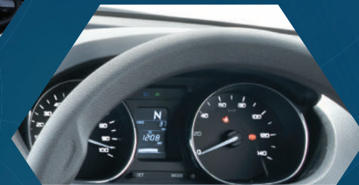
Chrome ringed instrument cluster with high-resolution, segmented driver information system