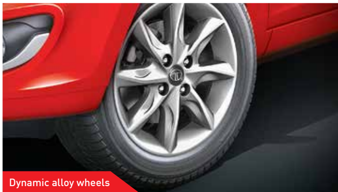
Dynamic alloy wheels

*For class defined as compact manual hatch as per SIAM.