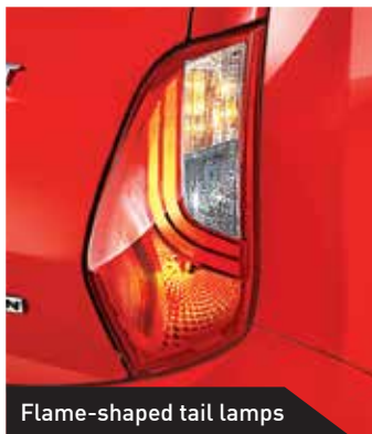
Flame-shaped tail lamps