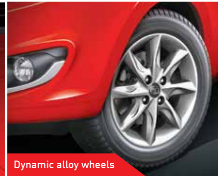
Dynamic alloy wheels

Tata signature grille with unique humanity line in Piano Black finish and first-in-class* Smoked projector headlamps