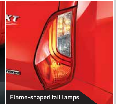
Flame-shaped tail lamps