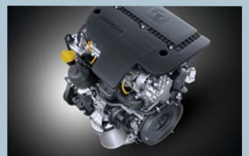
REFINED 90PS ENGINE