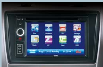
NEW TOUCHSCREEN MULTIMEDIA NAVIGATION