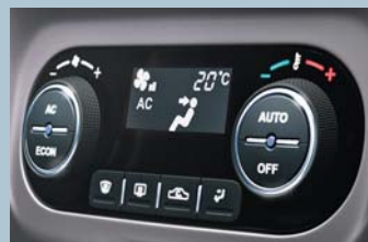
NEW AUTOMATIC CLIMATE CONTROL