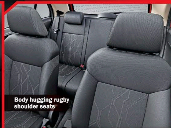
Body hugging rugby shoulder seats

*Class is defined as compact manual hatch as per SIAM.