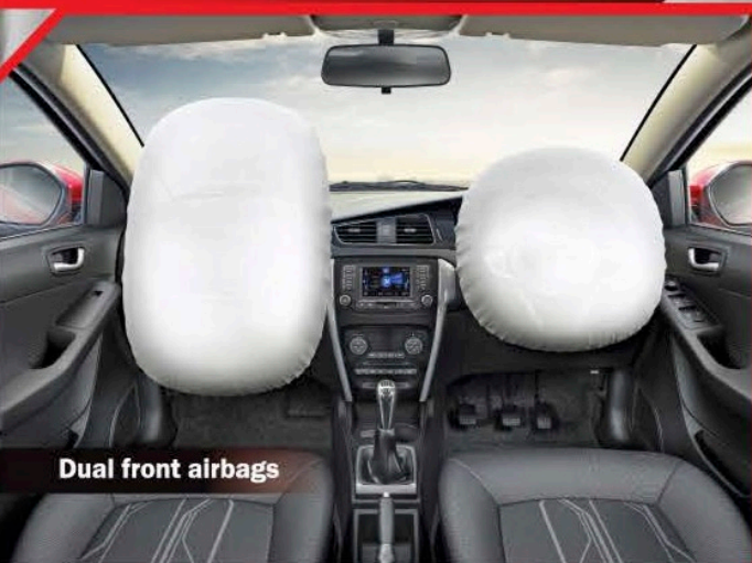
Dual front airbags