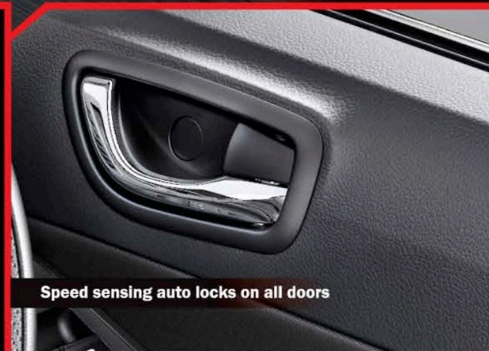
Speed sensing auto locks on all doors