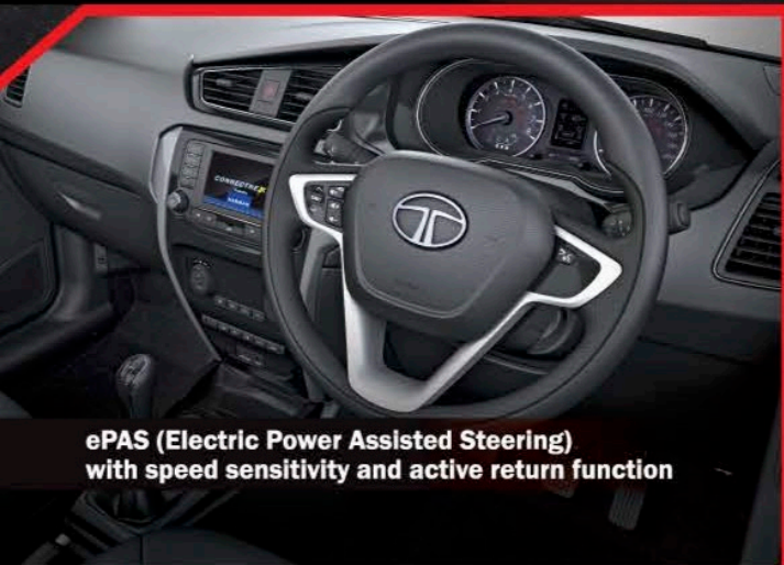
ePAS (Electric Power Assisted Steering) with speed sensitivity and active return function

Experience comfort like never before with its segment superior cabin space and impressive list of comfort features.