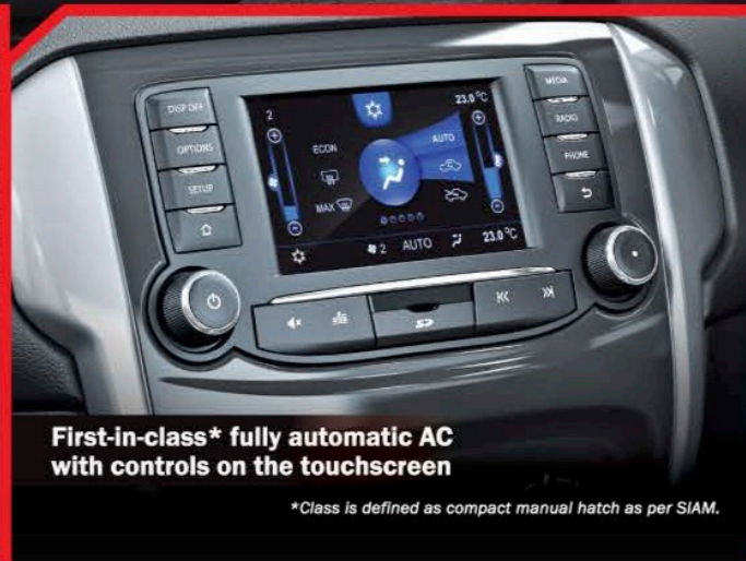
First-in-class* fully automatic AC with controls on the touchscreen

*Class is defined as compact manual hatch as per SIAM.