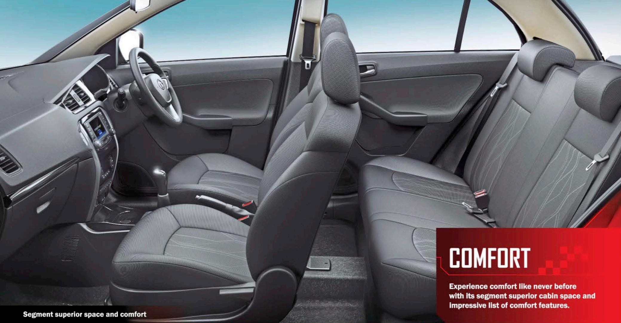
Segment superior space and comfort