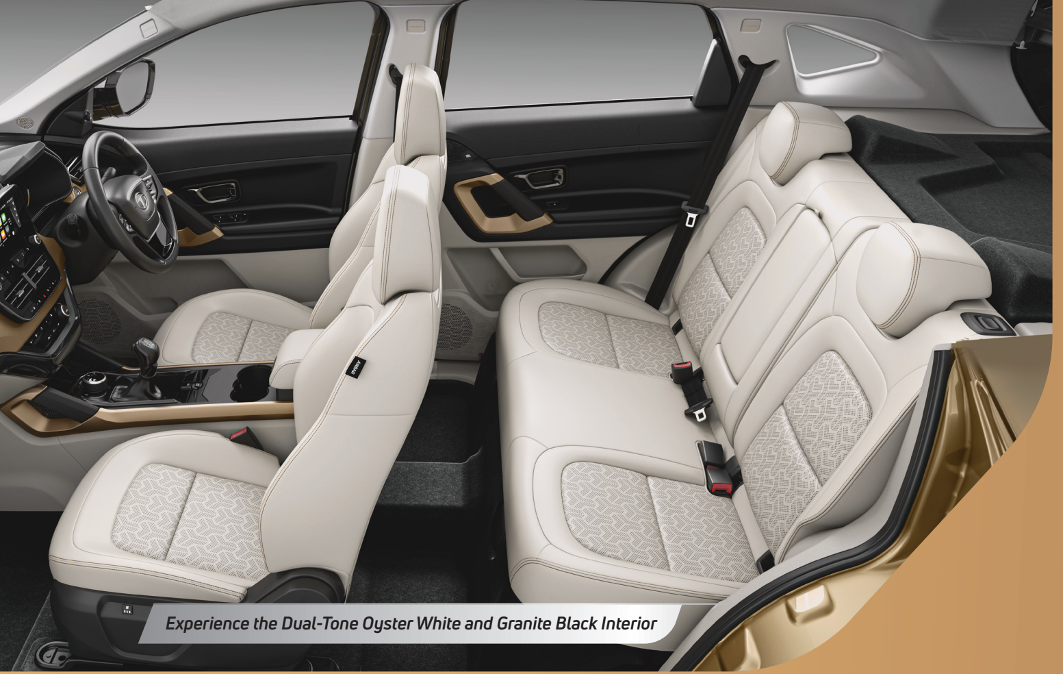
Experience the Dual-Tone Oyster White and Granite Black Interior