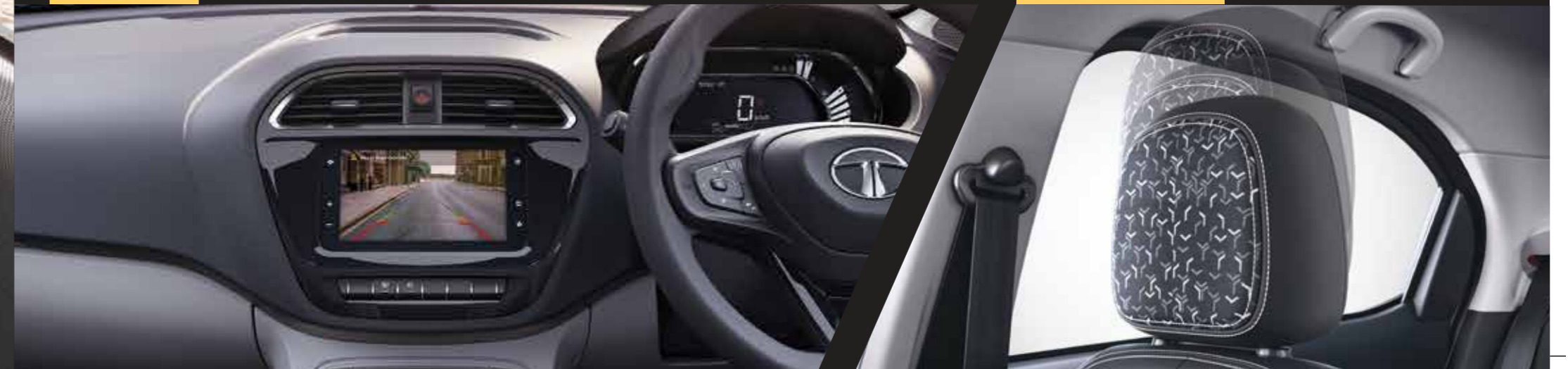
Adjustable Front Headrest