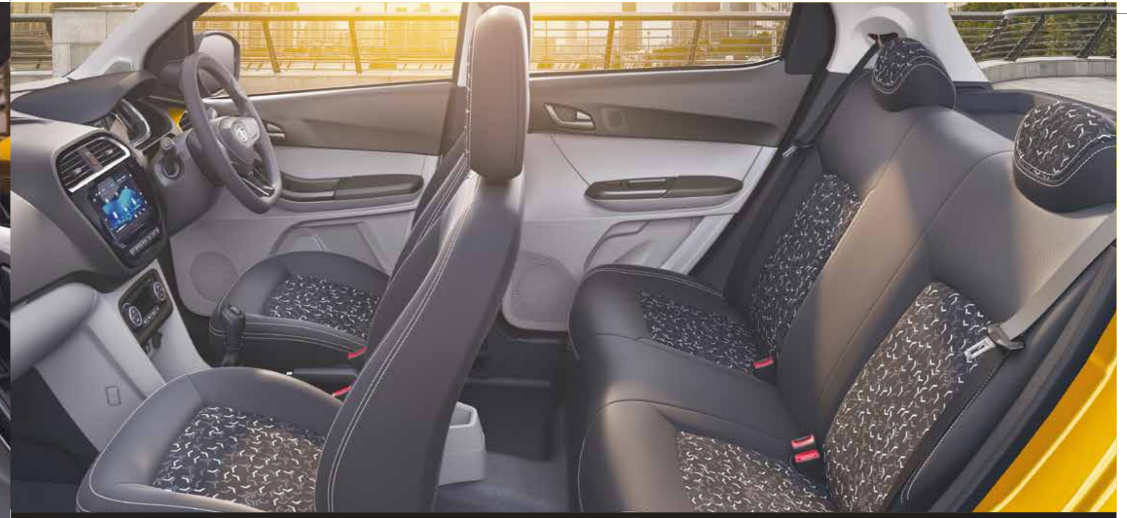
Classy & expansive space with a premium dual tone interior theme. Premium body-hugging seats with elegant dual tone, tri-arrow designed upholstery.