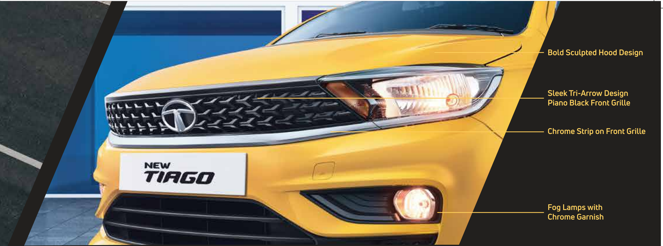
Bold Sculpted Hood Design