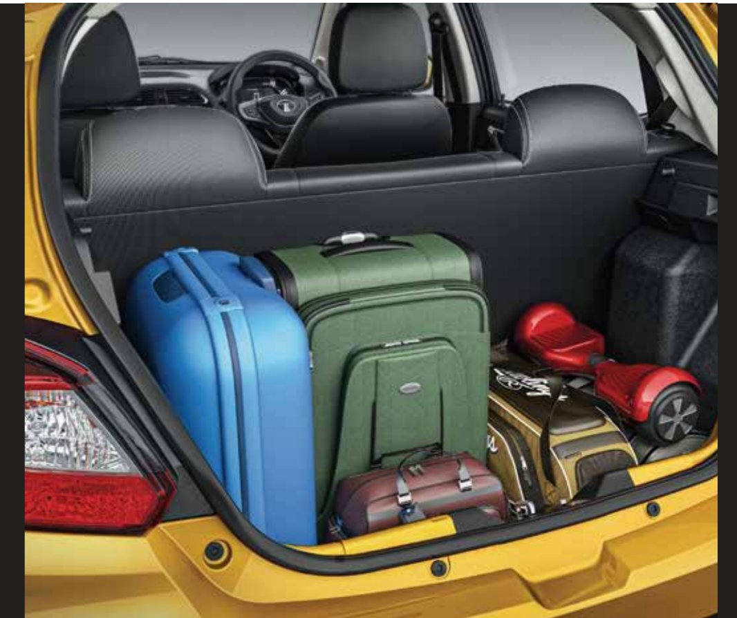
242 l Boot Space