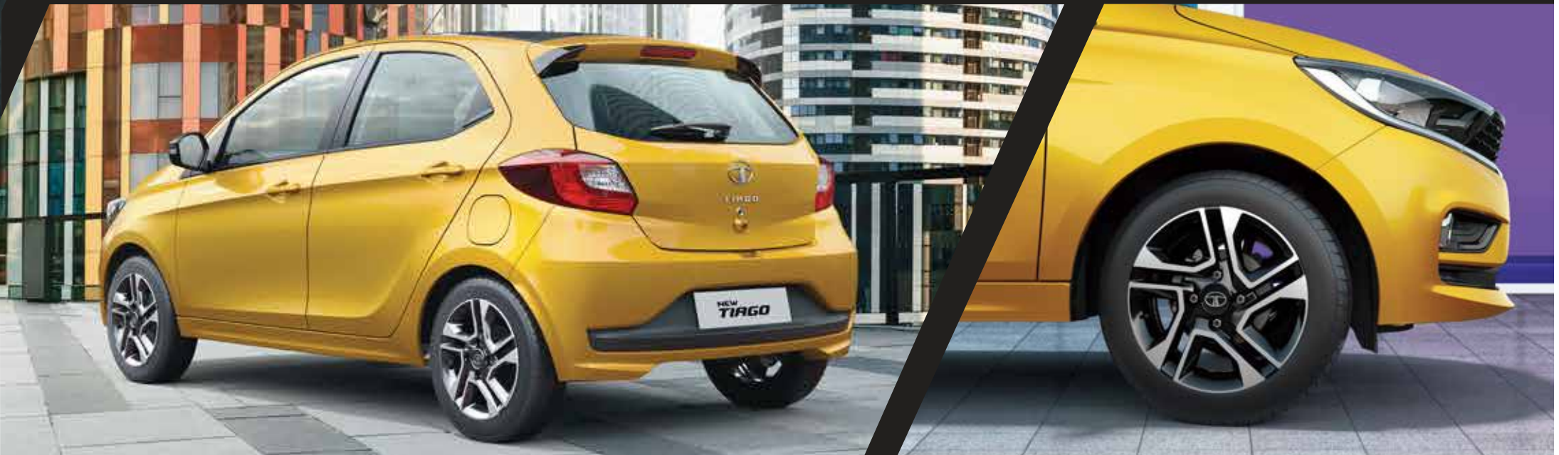
Boomerang Shaped Tail Lamps with Rear Defogger & Wiper