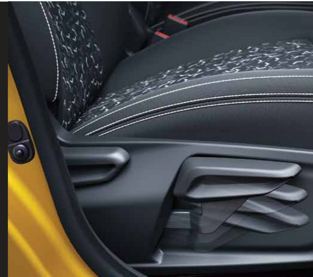
Height Adjustable Driver Seat