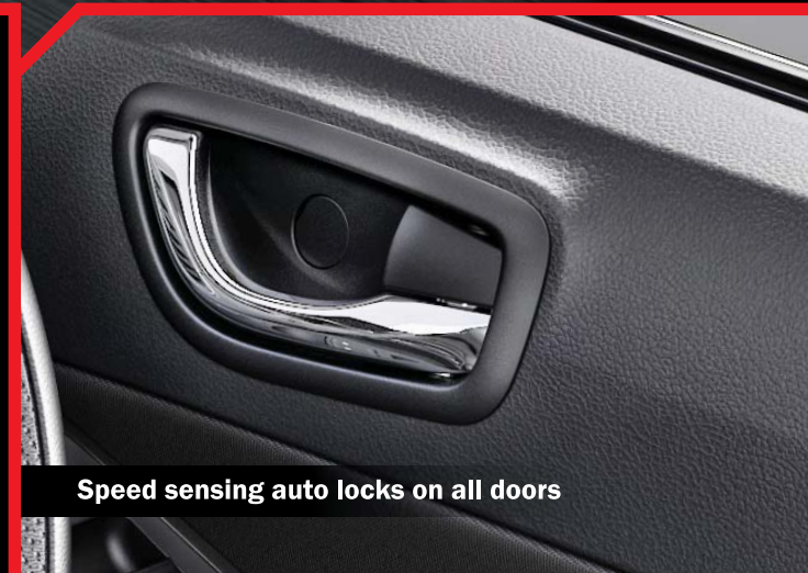
Speed sensing auto locks on all doors