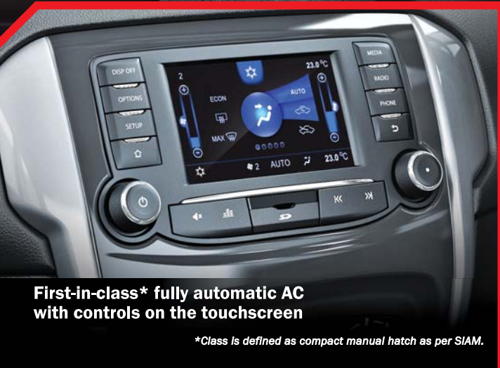
First-in-class* fully automatic AC with controls on the touchscreen