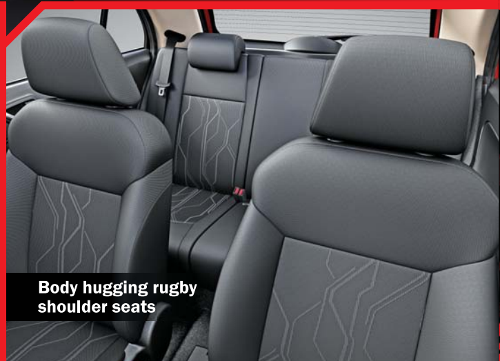
Body hugging rugby shoulder seats