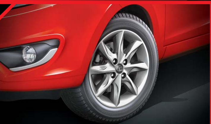
Dynamic alloy wheels

Tata signature grille with unique humanity line in Piano Black finish and first-in-class* Smoked projector headlamps