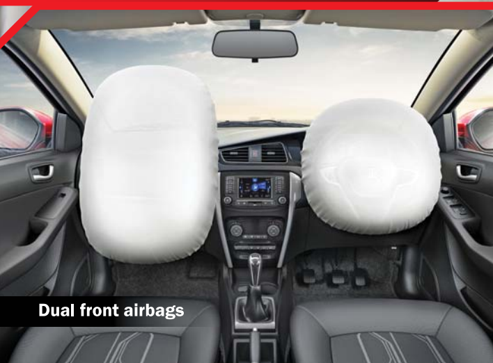
Dual front airbags