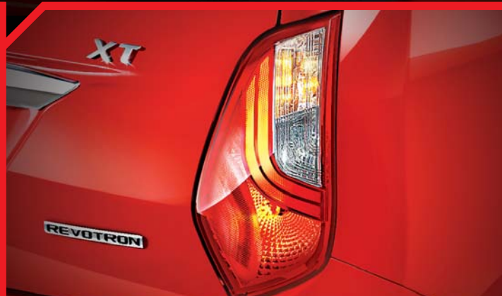
Flame-shaped tail lamps