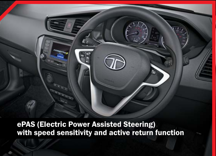
ePAS (Electric Power Assisted Steering) with speed sensitivity and active return function