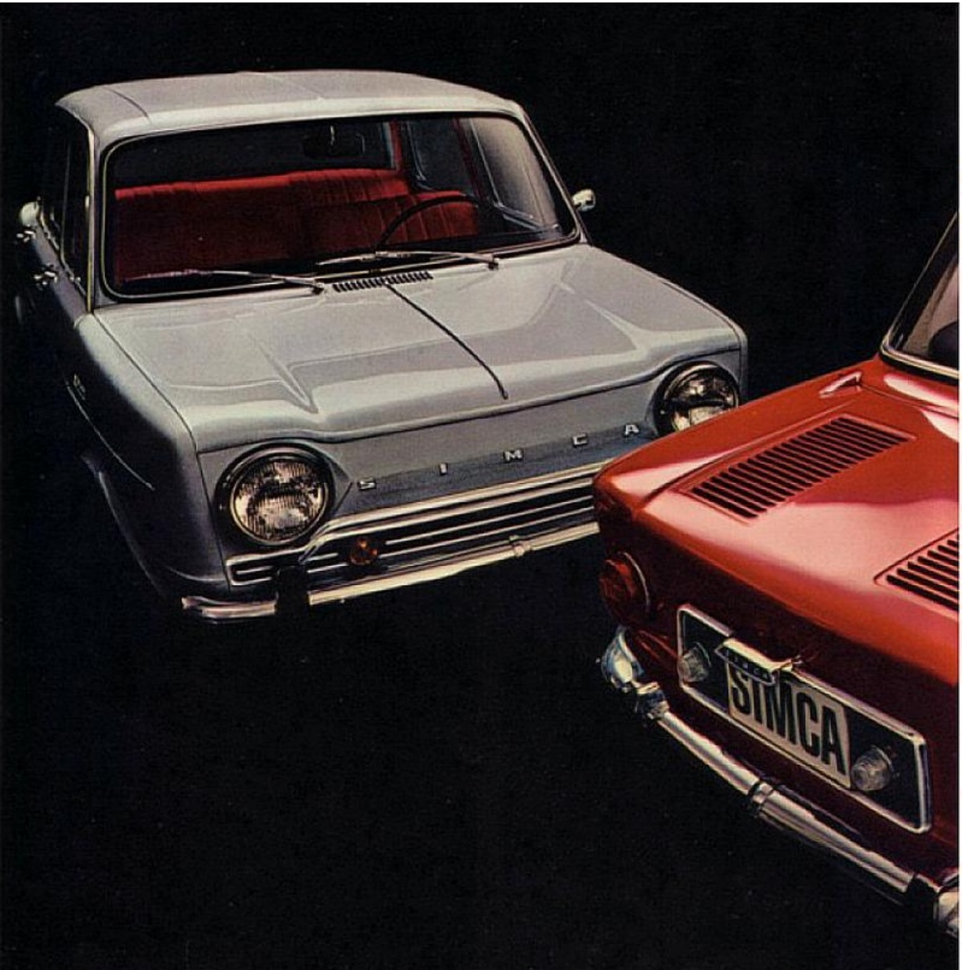
on cover, Simca GLS in Estoril Blue. Shown here (from left to right), Simca GLS in Murphy Grey, Simca Deluxe in Turner Red and Simca 1000 in Montreux Blue.