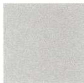
Platinum Metallic (67) Interior: Neutral 1 Gray Neutral/Ebony 2 Ebony 3