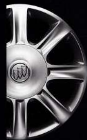
16" deluxe wheelcover