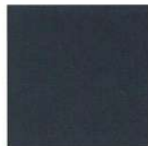
Slatestone Metallic (46) Interior: Neutral 1 Gray Neutral/Ebony 2 Ebony 3