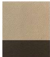
Neutral Leather/Dark Neutral Trim