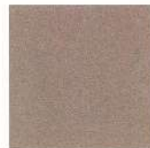
Sandstone Metallic (53) Interior: Neutral 1 Neutral/Ebony 2 Ebony 3