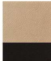
Neutral Leather/Ebony Trim