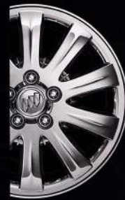
17" Chrome-Tech aluminum wheel