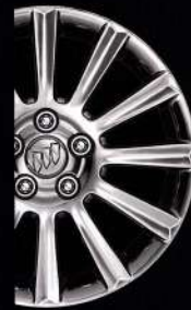
17" chrome-plated aluminum wheel