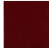
Red Jewel Tintcoat (80) 4 Interior: Neutral 1 Gray Neutral/Ebony 2 Ebony 3