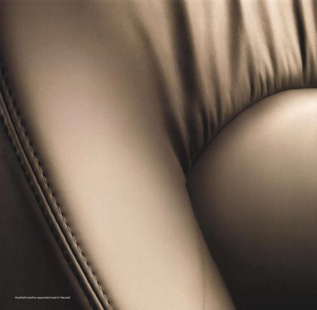
Available leather-appointed seat in Neutral.