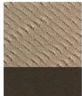
Neutral Cloth/Dark Neutral Trim