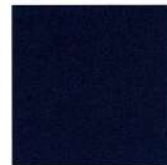
Midnight Blue Metallic (37) Interior: Neutral 1 Gray Neutral/Ebony 2 Ebony 3