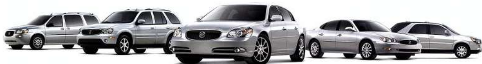
Terraza, Rainier, Lucerne, LaCrosse and Rendezvous: The Buick family for 2007.

*Visit onstar.com for limitations and details. **Whichever comes first. Limited warranty. See dealer for details.