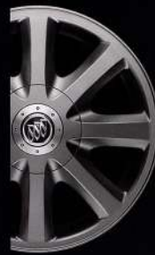
16" aluminum wheel