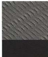
Gray Cloth/Dark Gray Trim