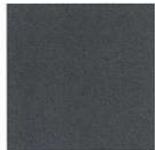
Stone Gray Metallic (42) Interior: Neutral 1 Gray Neutral/Ebony 2 Ebony 3