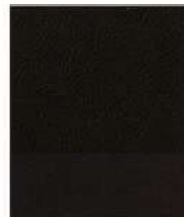
Ebony Leather/Ebony Trim

1 Not available on CXE. 2 Not available on CX and CXL. 3 Not available on CX. 4 Available at extra cost. Late availability.