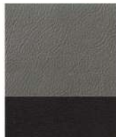
Gray Leather/Dark Gray Trim