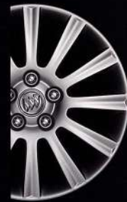
17" aluminum wheel