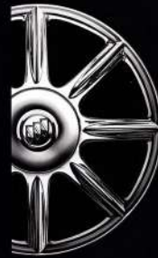
17" chrome-plated aluminum wheel