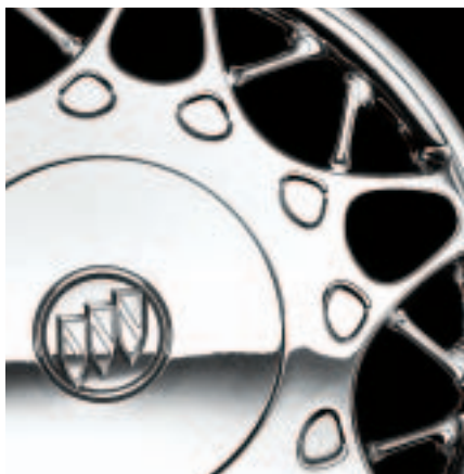
15" Chrome-Plated Wheelcover