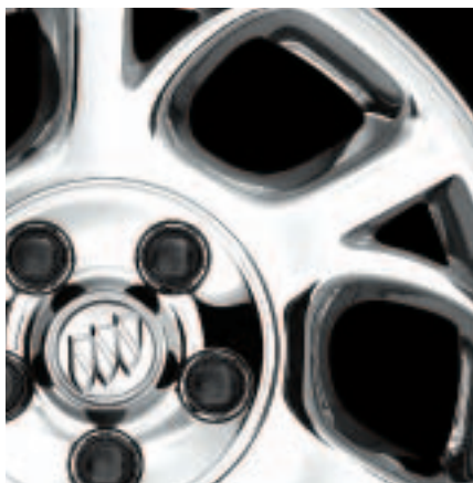
16" Special Edition Chrome-Plated Aluminum Wheel