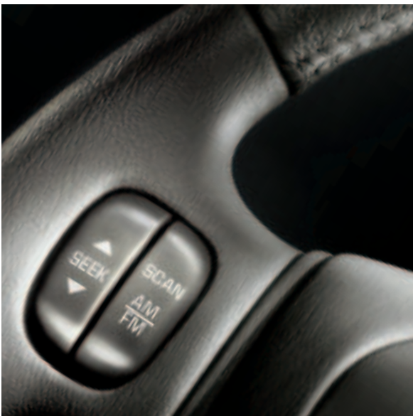
[ PLATE 4 ] Available steering wheel controls allow audio and cruise control adjustments with the touch of a finger.