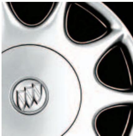
15" Deluxe Wheelcover