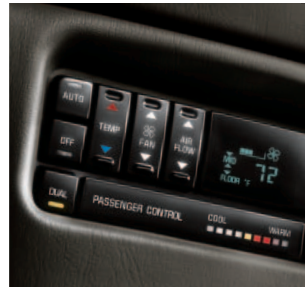
[ PLATE 6 ] Available automatic dual-zone climate control means personalized comfort.