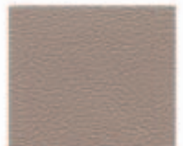
Taupe Leather Trim