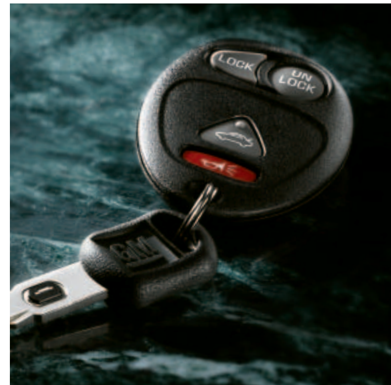
from your key ring.