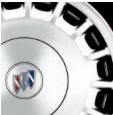
15" Aluminum Wheel