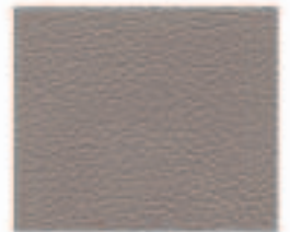
Gray Leather Trim