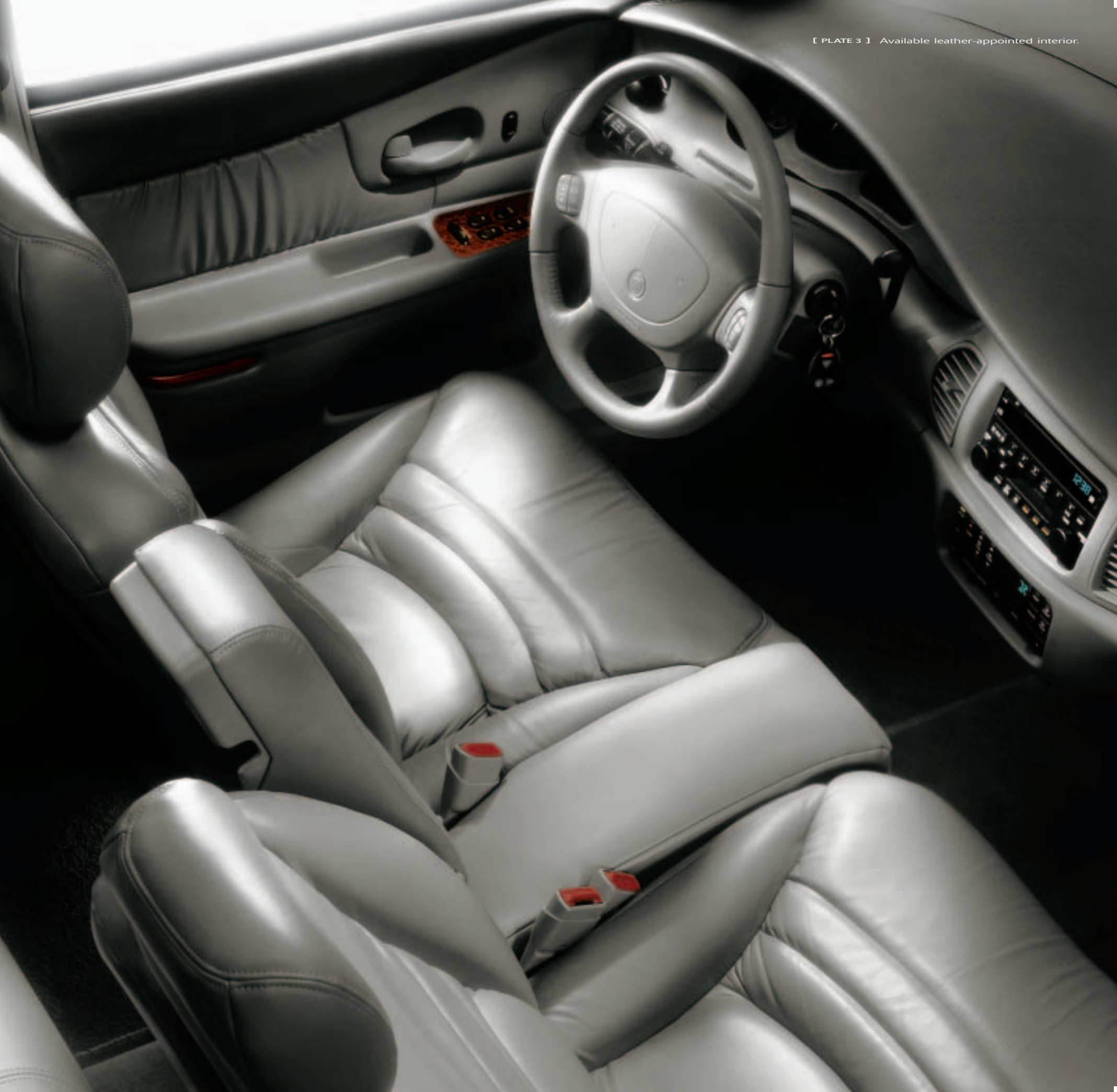
[ PLATE 3 ] Available leather-appointed interior.