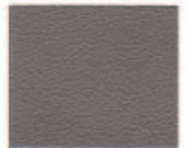
Graphite Leather Trim