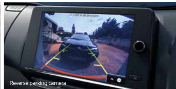
Reverse parking camera