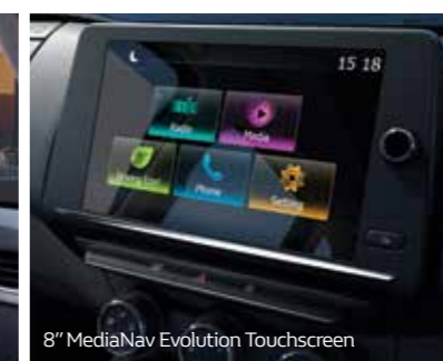
8" MediaNav Evolution Touchscreen