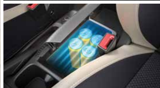
Cooled storage in centre console