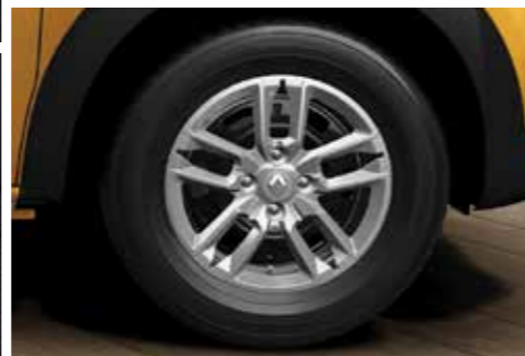
14" wheel covers