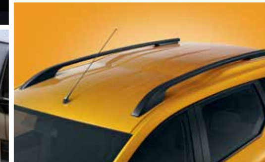
Longitudinal roof bars