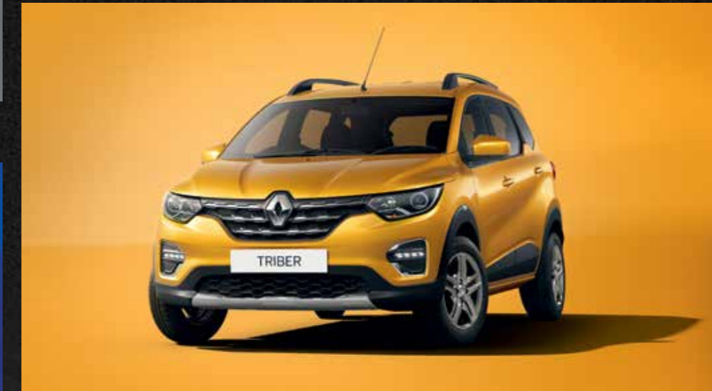
HONEY YELLOW (MP)