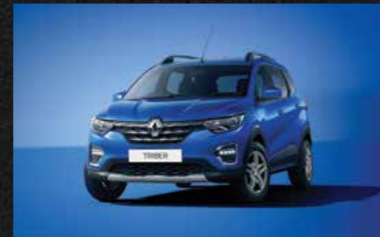
ELECTRIC BLUE (MP)