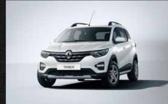
ICE COOL WHITE (NM)