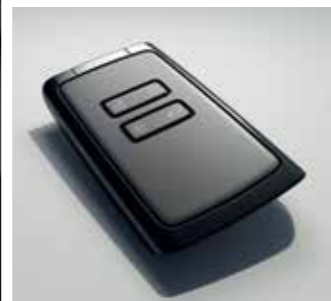
Keyless entry with push-button start/stop