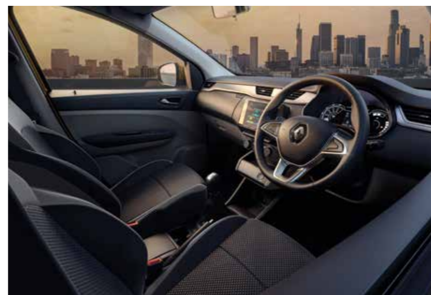
Dynamique interior with Japda fabric upholstery