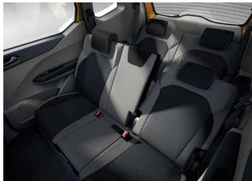
Dual tone 3D Space fabric upholstery