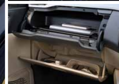
Cooled lower glovebox