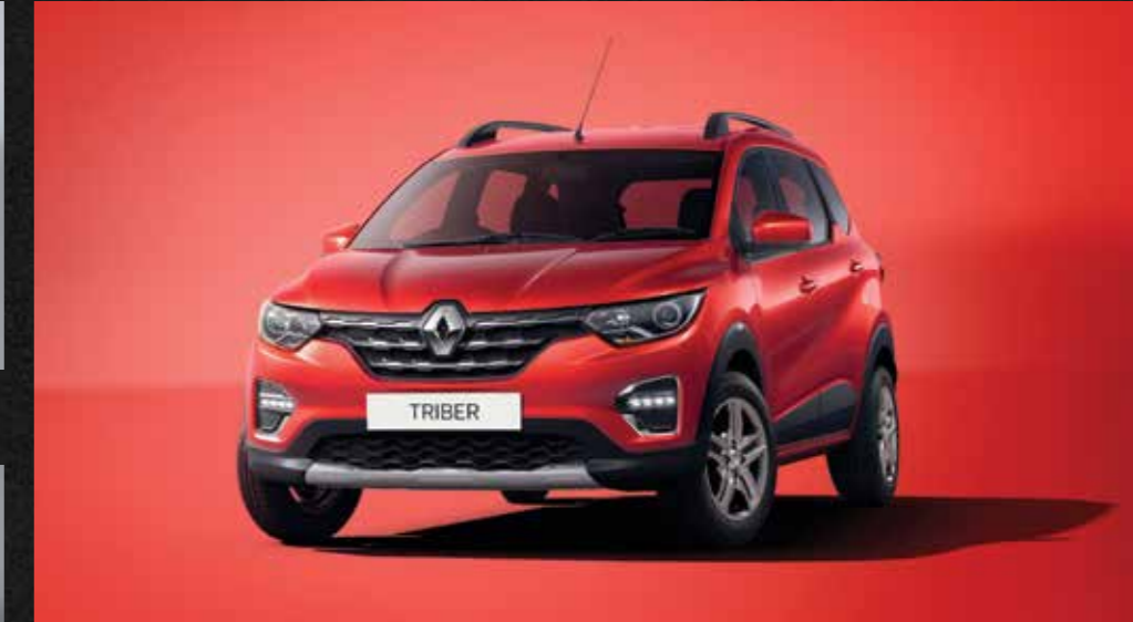
FIERY RED (MP)