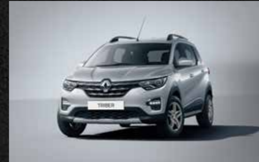
MOONLIGHT SILVER (MP)