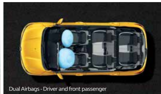
Dual Airbags - Driver and front passenger