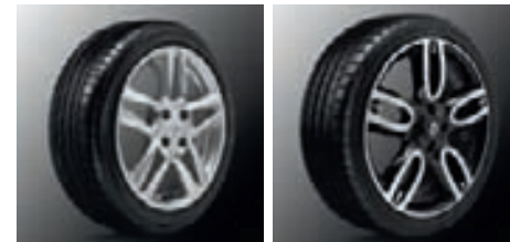
16" ALLOY WHEELS (STANDARD ON DYNAMIQUE) 17" ALLOY WHEELS (STANDARD ON GT LINE)