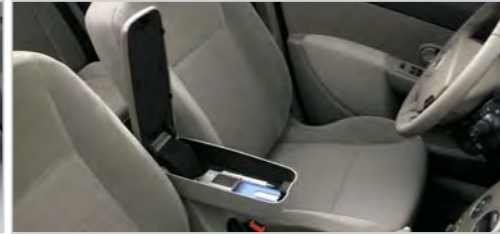
FRONT CENTRAL ARM REST Renault Design perfectly integrated. The compartment provides storage for pens and cellphones etc. Hook at rear for handbag. Recess for mobile ashtray.