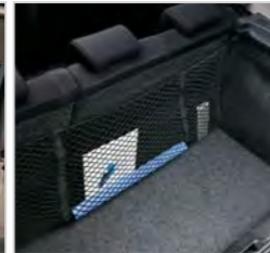
ENVELOPE NET Practical for holding small objects in the boot. Acts as additional storage in the boot. Comprises 3 compartments.