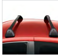
STEEL TOURING LINE ROOF BARS Set of integrated roof bars, steel profile in black PVC tube. Weight limit: 80kg.