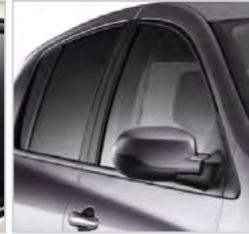
SMASH & GRAB WINDOW FILM Increases the windows' resistance to impacts and offers protection against car-jacking. Much better protection than the simple tinted windows.