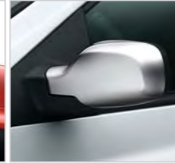
CHROME MIRROR HOUSINGS Top-of-the-range look chrome mirror housings to replace the standard housings and add a touch of class to your Clio 3.