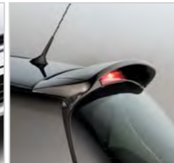
SPORT REAR SPOILER Aerodynamic rear spoiler. Fitted on a base.