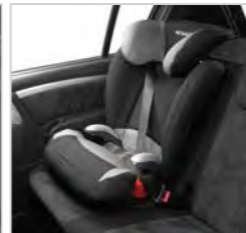
KID PLUS CHILD SEAT For children from 4 to 10 years. Weight 6.8kg.