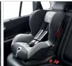
DUO PLUS ISOFIX CHILD SEAT For children between 9 months to 4 years. 5-point harness. "ISOFIX upper mounting" belt. Easy to install due to the Isofix hook locking system. Weight 9kg