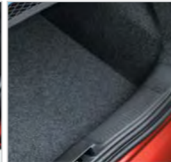
BOOT CARPET Made-to-measure boot mat which perfectly matches the shape of the boot. Hard wearing and washable.