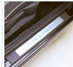
FRONT DOOR SILLS Aluminium appearance. Clio branded. Protects the door sill plate.