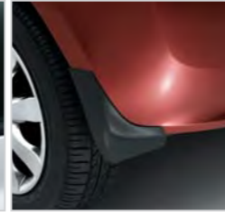
MUDFLAPS Protect the bottom of the car body from mud splashes or chipping. Black PVC.