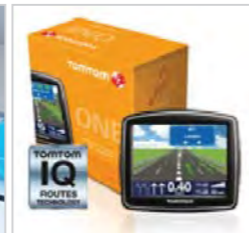
NAVIGATION SYSTEMS State-of-the-art GPS with South African programmed road maps.