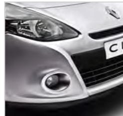
FOG LIGHT KIT Improves the driving safety and aesthetics of the front panel of the vehicle.

Enables you to personalise and differentiate your vehicle. Enhances the style and emphasises the sporty character of the vehicle. The different elements available offer several levels of personalisation. The modular nature of the body kit elements is the utmost expression of personalisation.