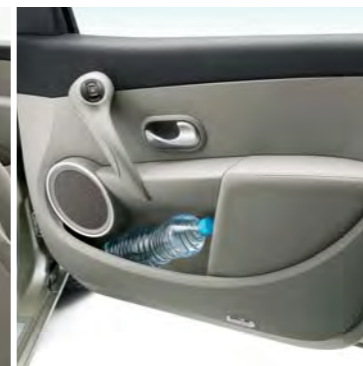
Features and images may vary and be optional depending on model, and are subject to change without notice.