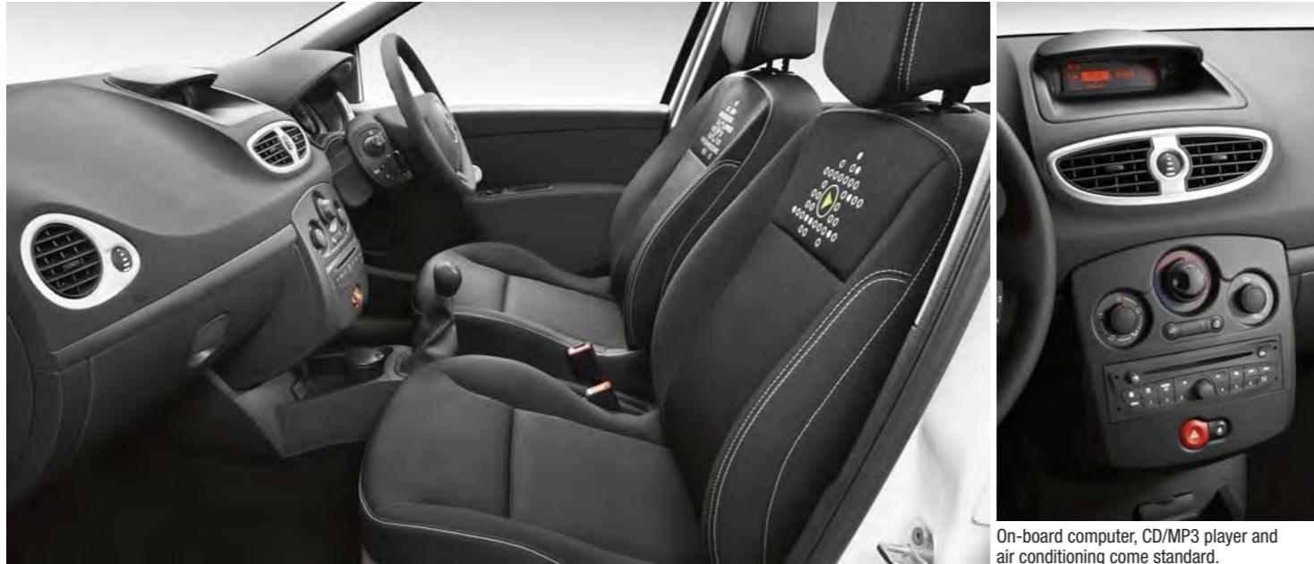
On-board computer, CD/MP3 player and air conditioning come standard.

The Clio 3 Yahoo! includes a list of equipment and technology designed to keep you connected with features like Radio/CD/MP3 player, RCA audio jack, remote audio controls, Parrot Bluetooth, cruise control, on-board computer, electric front windows, electric mirrors and air conditioning..