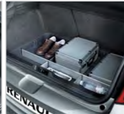
DIVIDABLE BOOT CARGO CONTAINER Perfectly matches the shape of the boot. Separable tray with aluminium removable partitions. Semi-rigid material, washable.