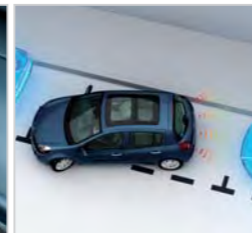
PARK DISTANCE CONTROL SENSORS Detects obstacles which could be impacted by the vehicle whilst reversing.