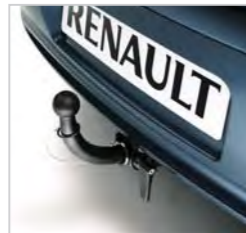
AUTOMATIC QUICK RELEASE TOW BAR Ball removable without tools in only a few seconds. Designed for intensive use. Maintains the aesthetics of the vehicle once the ball is removed.