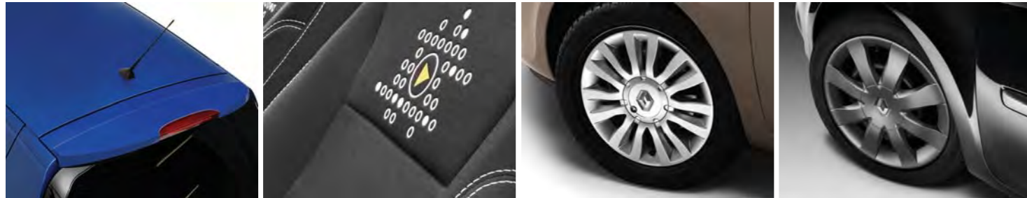
A sporty rear roof spoiler with integrated stop light on the Clio Yahoo! Plus.