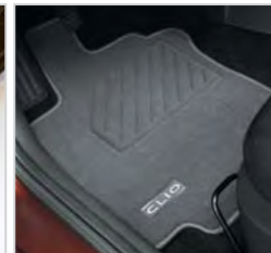
CARPET MATS Made-to-measure floor mats in various styles and finishes, plain and Clio branded. Waterproof and washable.