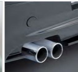
SPORTS EXHAUST Comprising a silencer and dual output. Compatible with Clio 3 sports kits.