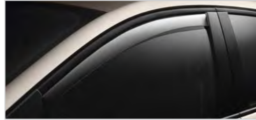
AIR DEFLECTORS Allows air in the passenger compartment to be regenerated. Smoked methacrylate.