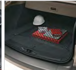
CARGO NET Restrains objects in the back of the boot. Is fastened by means of the attachments provided in the vehicle.