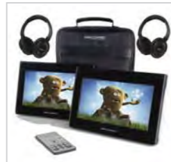
NEXTBASE PORTABLE DVD SYSTEM Rear seat in-car DVD system. Portable dual screen DVD with headphones. Plays DVD, CD, MP3 and games.