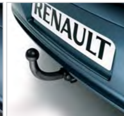
SWAN NECK TOW BAR The ball can be removed using tools to preserve the aesthetics of your Renault.