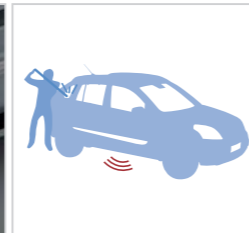
COMPACT ALARM Keep your Renault safe and secure. Audible remote alarm system warns against attempted intrusions.