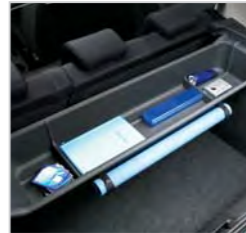
COMPARTMENT TRAY Under rear parcel shelf. Practical for storing & protecting small objects. Separate compartments and non-skid bottom.