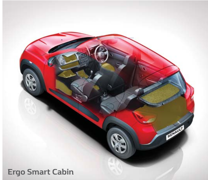
Ergo Smart Cabin

boot space of 300 litre that can be extended up to 1,115 litre. The Renault KWID also features intermittent wipers that help during drizzles, new rear ELRs that help the seat belt to lock upon sudden impact and a front power socket. Additionally the new rear 12V power socket ensures phones remain charged in the backseat too.