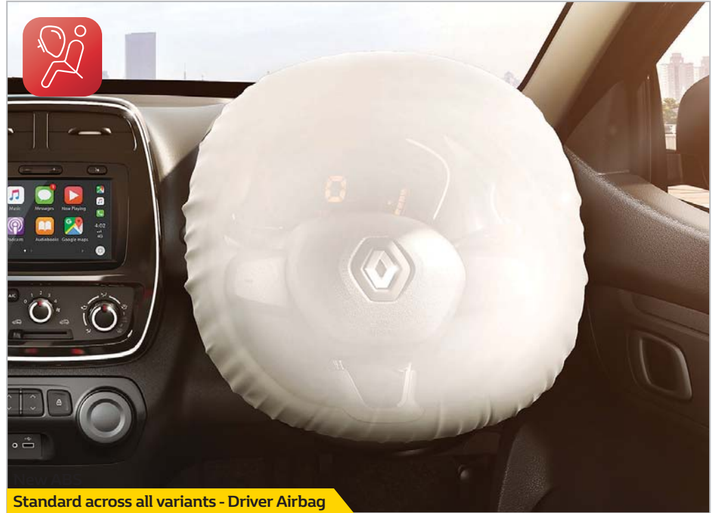
Standard across all variants - Driver Airbag

The Smart Control efficiency (SCe) engine technology for accurate air-to-fuel ratio monitoring, optimises performance and fuel efficiency. The suspension system of the Renault KWID is calibrated for an optimum ride . All the Renault KWID variants have front disc brakes with ABS and ensure a safe drive in all weather conditions and on different road surfaces. Further, these variants come with a driver airbag, a seat belt reminder, new rear retractable seat belts and central locking . Additionally, the front ELR seat belt with pretensioners and load limiters make every drive safer,