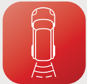
Reverse Parking Camera