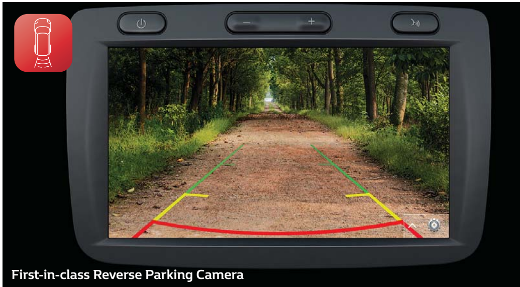
First-in-class Reverse Parking Camera