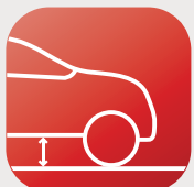
High Ground Clearance Of 180 mm