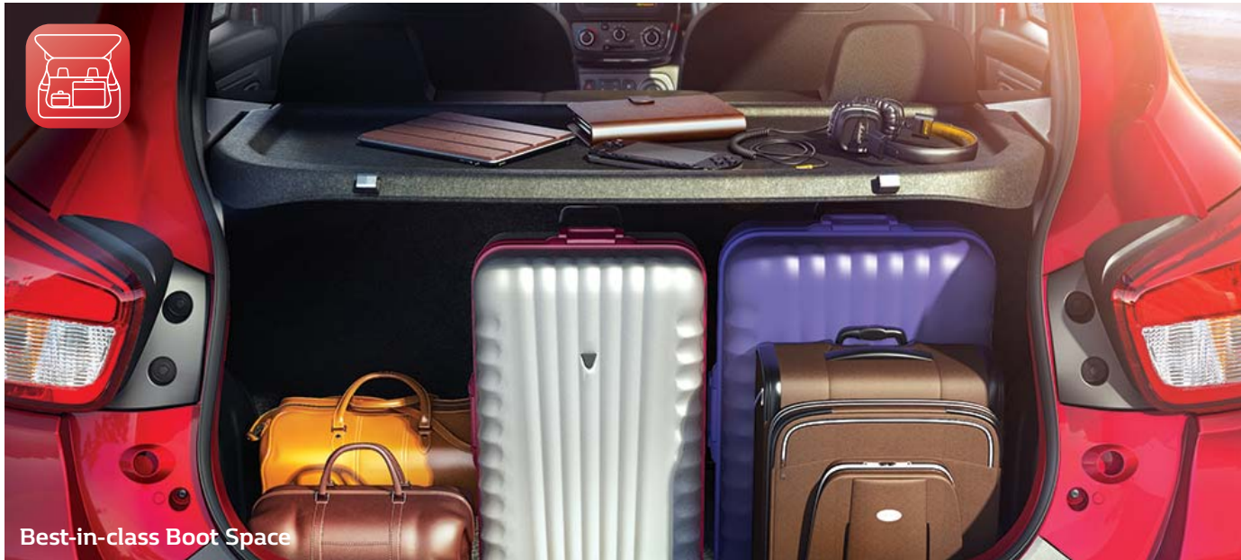
Best-in-class Boot Space