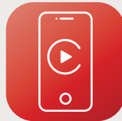
Apple CarPlay Android Auto™