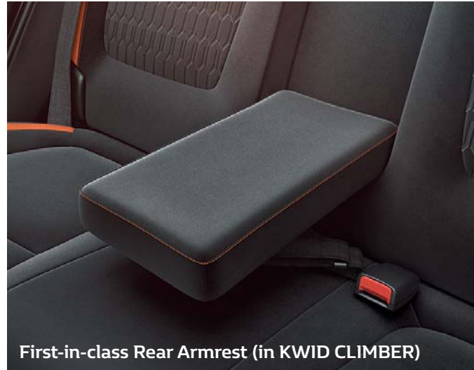
First-in-class Rear Armrest (in KWID CLIMBER)

most ideal seating and driving position. While the chunky steering wheel provides enhanced grip. At the back, the new first-in-class rear armrest of the KWID CLIMBER makes for a more relaxed posture.