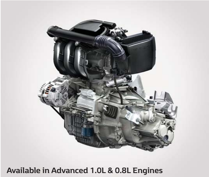
Available in Advanced 1.0L & 0.8L Engines

The Smart Control efficiency (SCe) engine technology for accurate air-to-fuel ratio monitoring, optimises performance and fuel efficiency. The suspension system of the Renault KWID is calibrated for an optimum ride . All the Renault KWID variants have front disc brakes with ABS and ensure a safe drive in all weather conditions and on different road surfaces. Further, these variants come with a driver airbag, a seat belt reminder, new rear retractable seat belts and central locking . Additionally, the front ELR seat belt with pretensioners and load limiters make every drive safer,