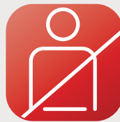
Seat Belt Reminder