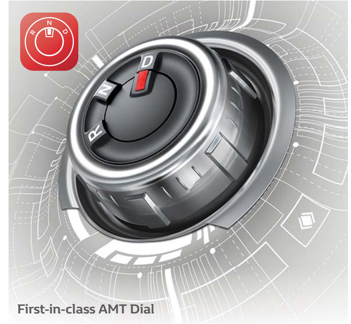
First-in-class AMT Dial

Bluetooth audio streaming & hands-free telephony. The innovative and easy-to-read Digital Instrument Cluster with on-board trip computer provides driving related information, while the gear shift indicator helps you achieve optimum fuel efficiency. To help parking even in the tightest spots, the KWID also comes with a new first-in-class Reverse Parking Camera .