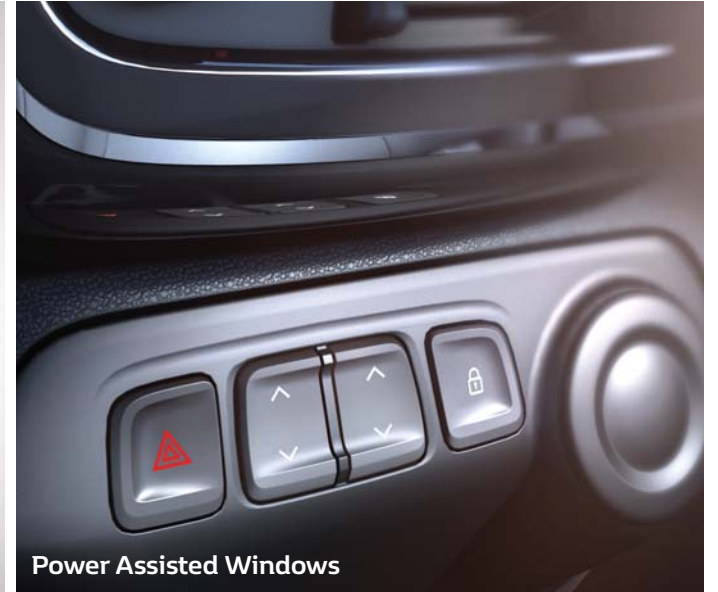
Power Assisted Windows