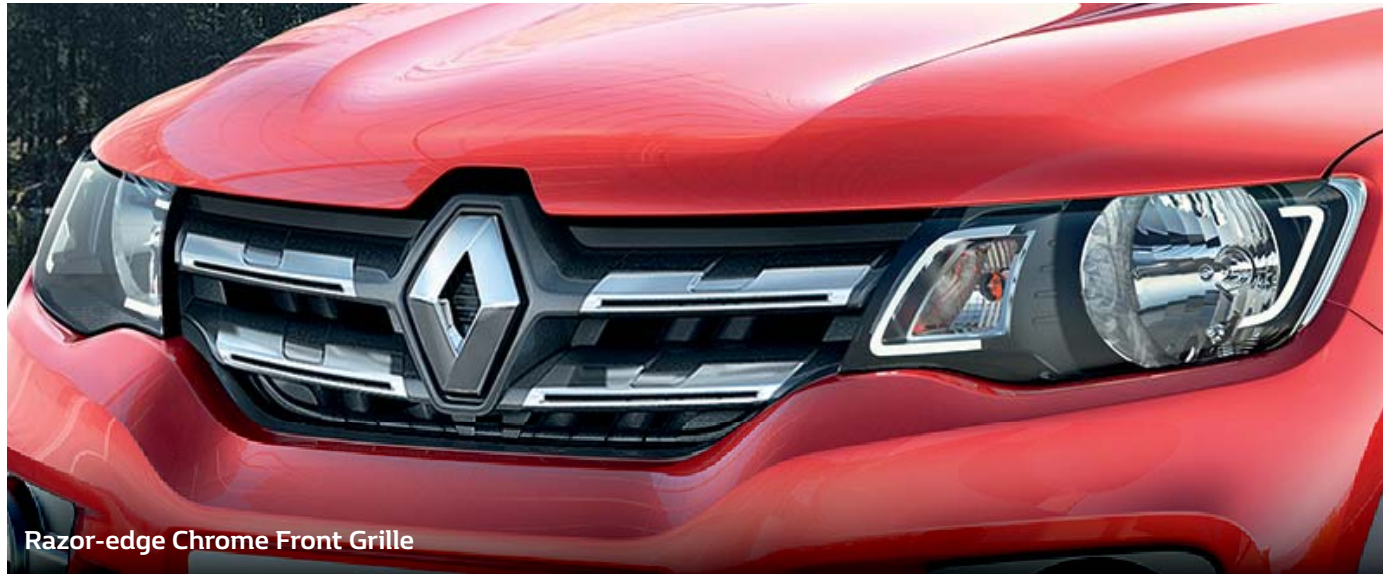
Razor-edge Chrome Front Grille

The Renault KWID is designed to turn heads. Its SUV-inspired design with short overhangs along with a 180 mm high ground clearance exudes strength and robustness. The new Razor-edge Chrome Front Grille highlights the Renault diamond logo, while stylish fog lamps further enhance the