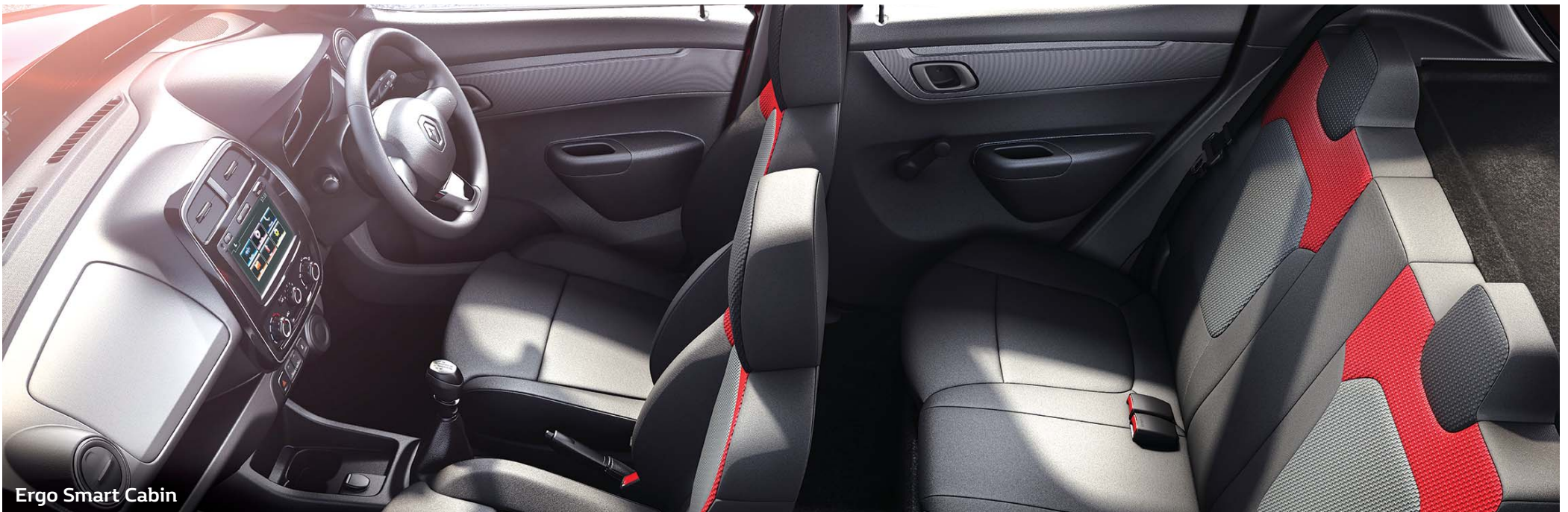
Ergo Smart Cabin