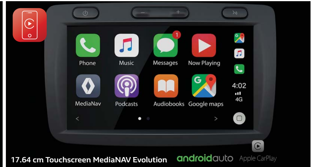
17.64 cm Touchscreen MediaNAV Evolution androidauto Apple CarPlay