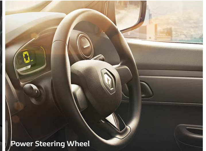
Power Steering Wheel