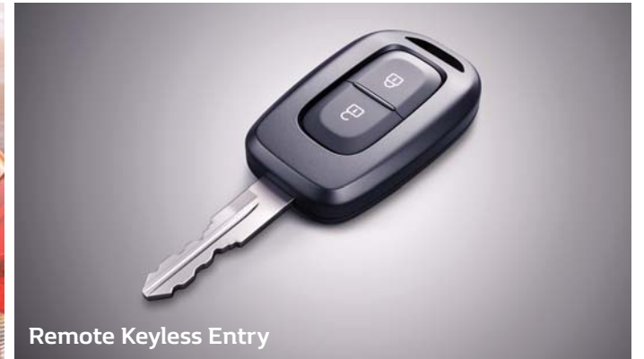
Remote Keyless Entry