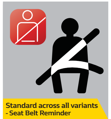
Standard across all variants - Seat Belt Reminder