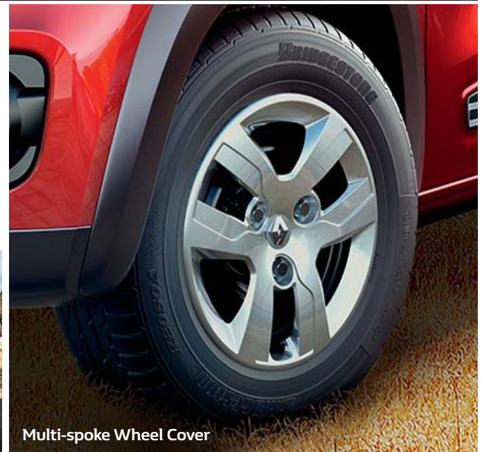
Multi-spoke Wheel Cover