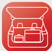
Best-In-Class Boot Space Of 0.3 m 3 (300 litre)