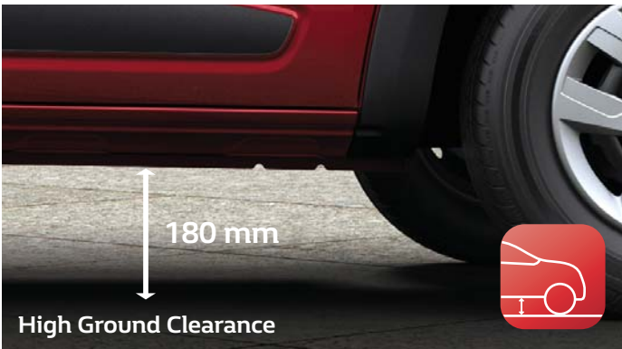
High Ground Clearance

forward in heavy traffic and keeps it steady on slopes.