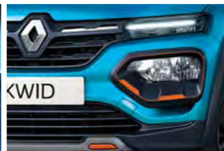
Climber front bumper detailing