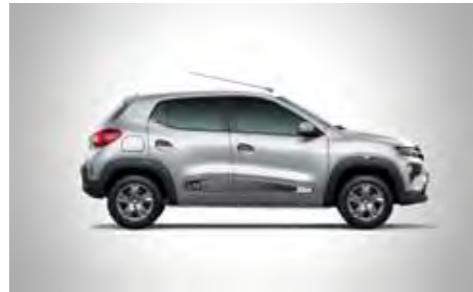
MOONLIGHT SILVER (MP)