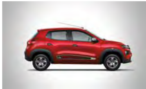
FIERY RED (MP)