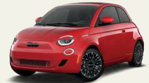
Red by (RED)