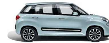
483 Bashment Blue