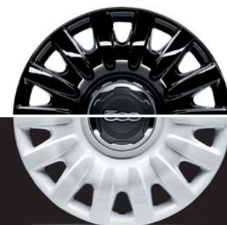
4XE 16" STEEL WHEELS WITH WHITE COVERS