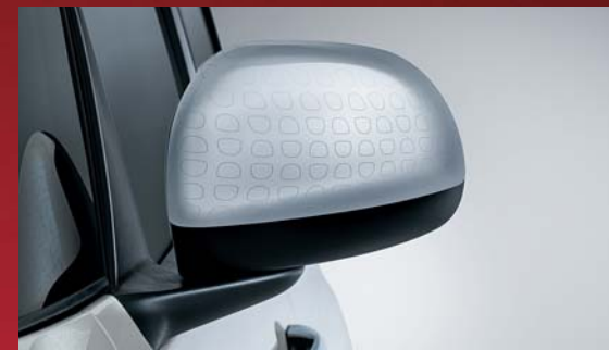
TECHNICS OUTLINE EFFECT ALUMINIUM MIRROR COVER