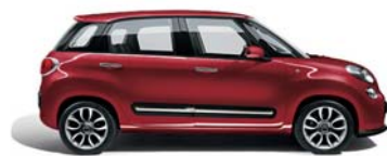
108 Opera Red (metallic)