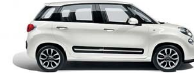
268 Bossa Nova White