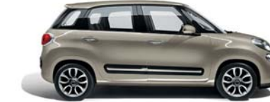
231 New Age Cream