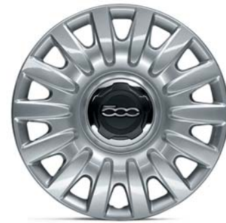
406 16" STEEL WHEELS WITH SILVER COVERS