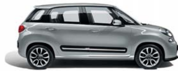
612 Minimal Grey (metallic)