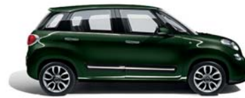
390 Beatbox green (metallic)