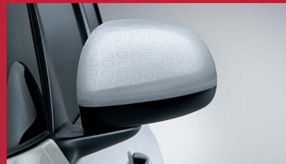
TECHNICS EFFECT WHITE MIRROR COVER