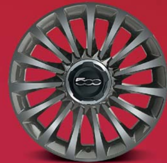
17" SILVER ALLOY WHEELS