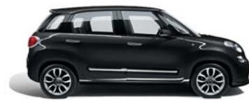
609 Heavy Metal Grey (metallic)