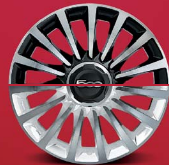
17" ALLOY WHEELS WITH WHITE DIAMOND FINISH