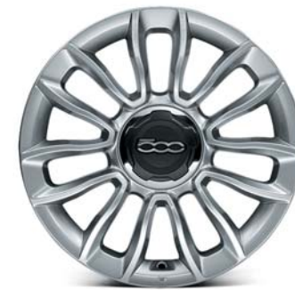
439 16" SILVER ALLOY WHEELS