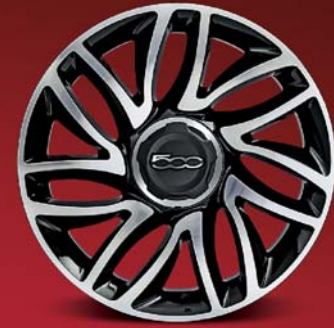
17" ALLOY WHEELS WITH BLACK DIAMOND FINISH