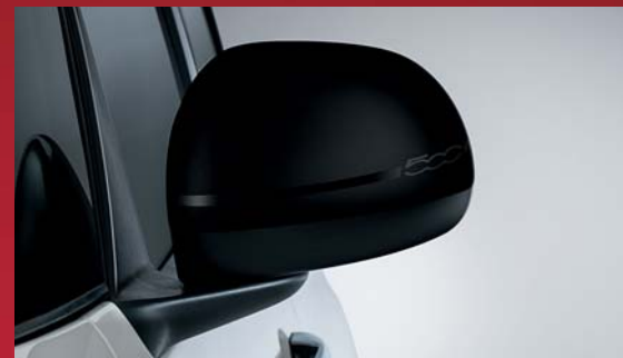
CERAMIC EFFECT BLACK MIRROR COVER