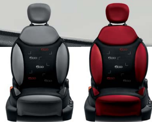
POP STAR TRIM LEVEL (PAINTED DASHBOARD)