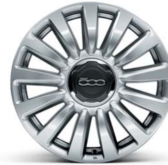
433 16" SILVER ALLOY WHEELS