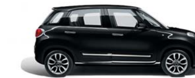
601 Darkwave Black