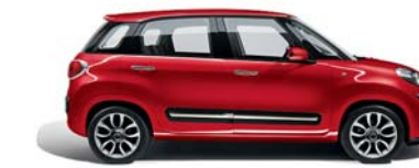
111 Pasodoble Red