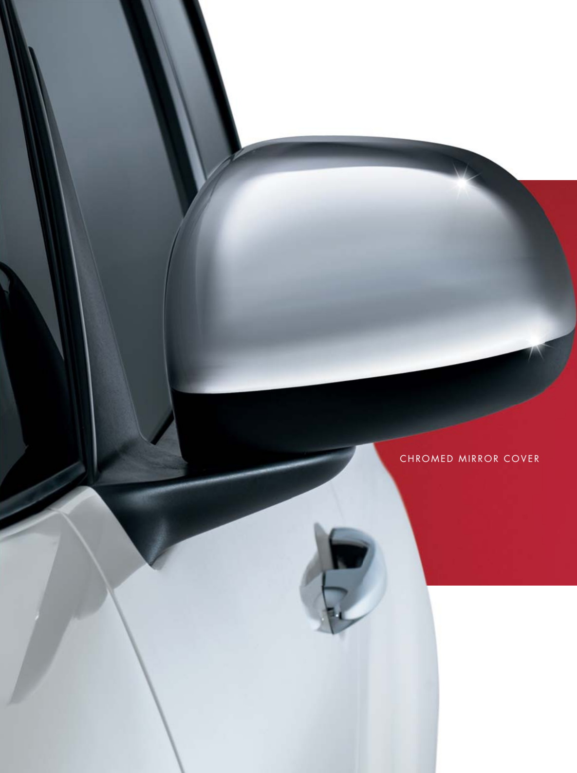
CHROMED MIRROR COVER