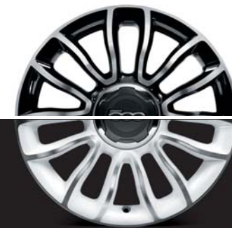
55E 16" ALLOY WHEELS WITH WHITE DIAMOND FINISH