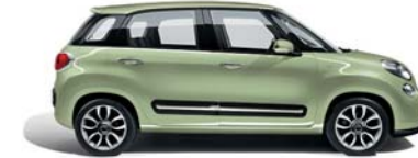
366 Vocal Green