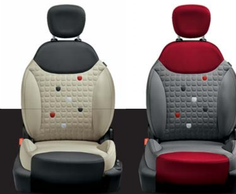
EASY TRIM LEVEL (SOFT TOUCH DASHBOARD)