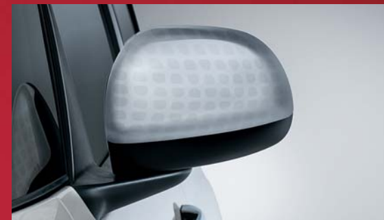
TECHNICS SILVER EFFECT ALUMINIUM MIRROR COVER