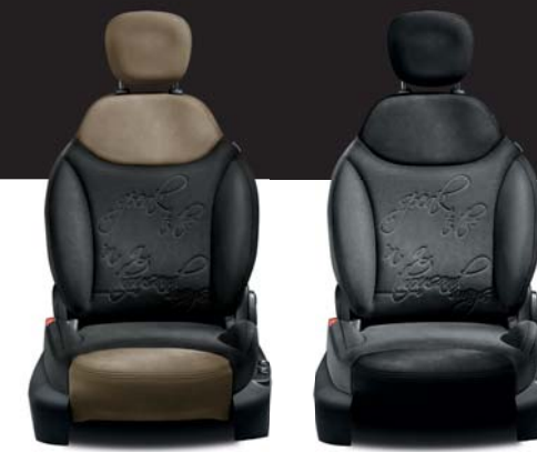
LOUNGE TRIM LEVEL (SUEDE DASHBOARD)