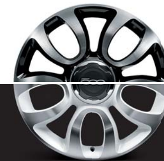
5FB 17" ALLOY WHEELS WITH WHITE DIAMOND FINISH