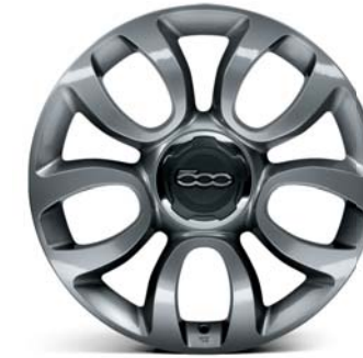
435 17" DARK GREY ALLOY WHEELS