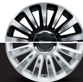
4WQ 16" ALLOY WHEELS WITH WHITE DIAMOND FINISH