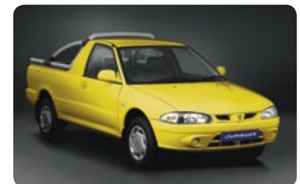
Canary Yellow (solid – GL, GS & GSX)

Other options and accessories for your Jumbuck are also available, please see your local dealer for full details.