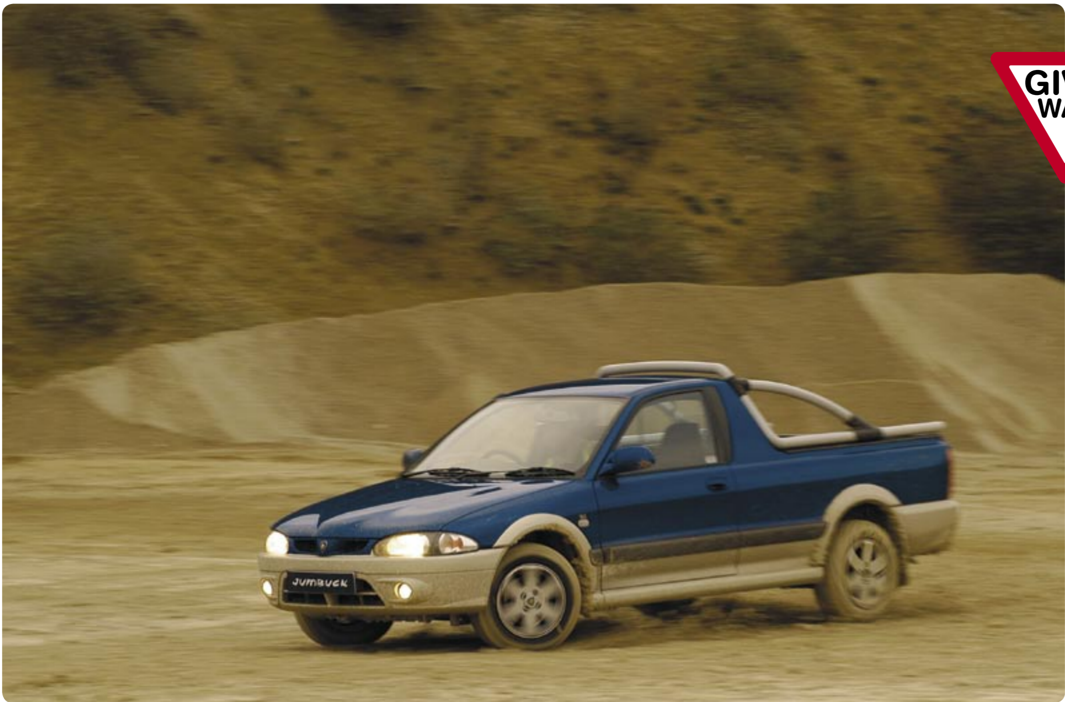
Model shown is GLS with optional styling bars