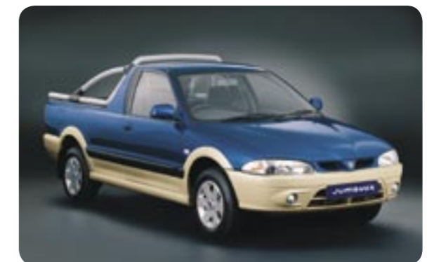
Deep Blue/ Champagne (metallic – GLS only)