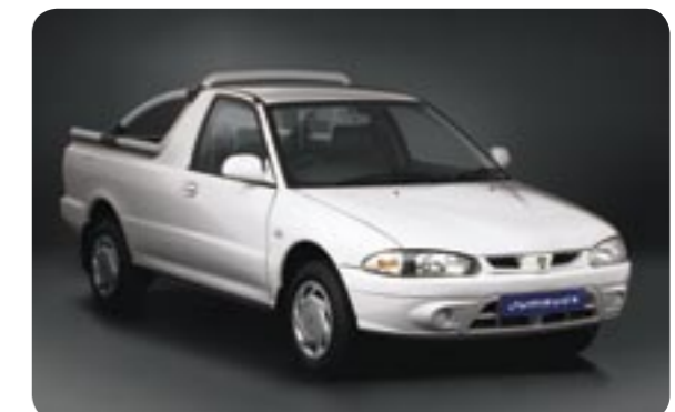
Diamond Silver (metallic – GL, GS & GSX)