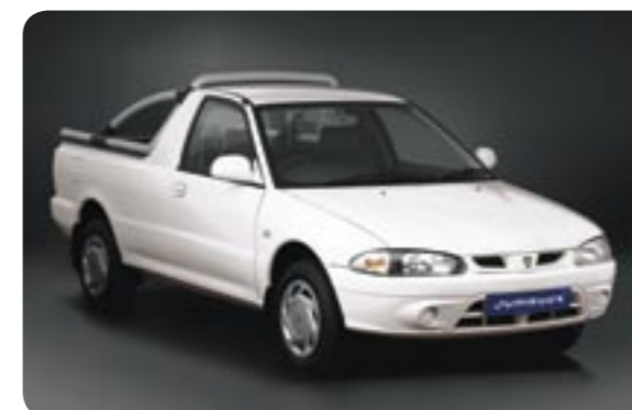
Dove White (solid – GL, GS & GSX)