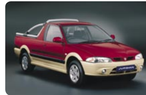
Mulberry Red/ Champagne (metallic – GLS only)