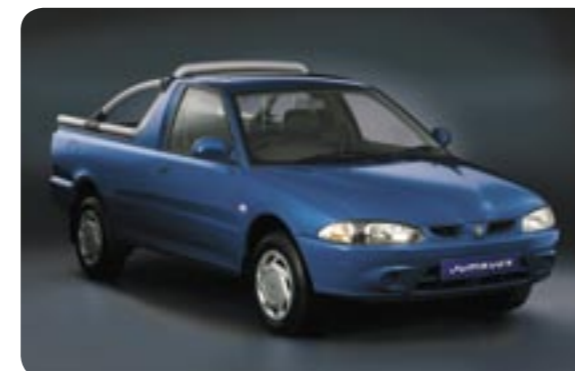
Deep Blue (metallic – GL, GS & GSX)