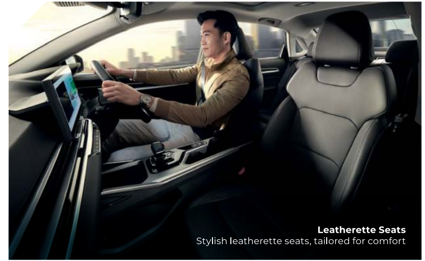
Leatherette Seats Stylish leatherette seats, tailored for comfort

From its striking design to its sophisticated details, the interior of the PROTON S70 is meticulously crafted to offer maximum comfort for you and your passengers, delivering an exceptional experience