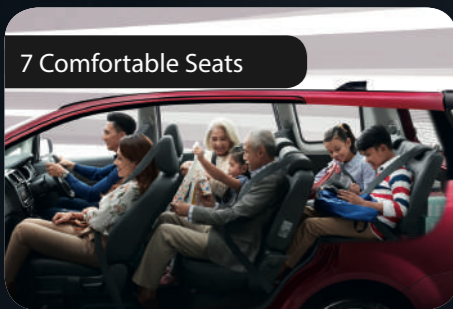
7 Comfortable Seats

To us, space equates to luxury and practicality and the EXORA has both. No wonder it's listed in the Malaysia Book of Records having set the record for "Most People in an MPV" making it an excellent choice for comfort no matter how long the journey.