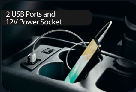
2 USB Ports and 12V Power Socket