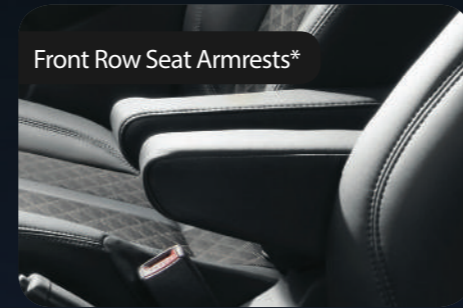
Front Row Seat Armrests*