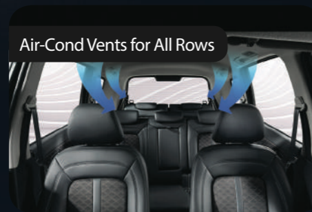
Air-Cond Vents for All Rows