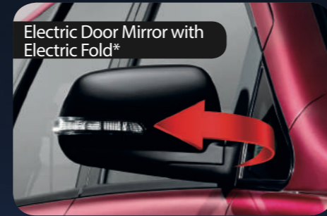
Electric Door Mirror with Electric Fold*