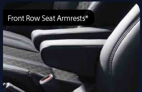
Front Row Seat Armrests*