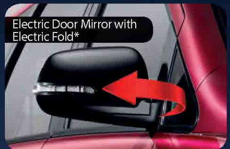
Electric Door Mirror with Electric Fold*