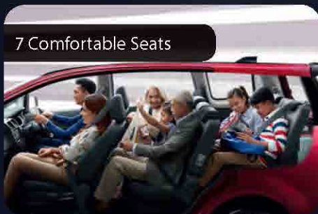
7 Comfortable Seats

To us, space equates to luxury and practicality and the 2019 EXORA has both. No wonder it's listed in the Malaysia Book of Records having set the record for "Most People in an MPV" making it an excellent choice for comfort no matter how long the journey.