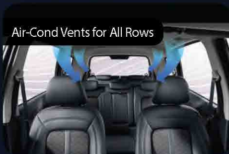
Air-Cond Vents for All Rows