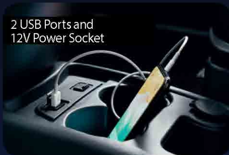
2 USB Ports and 12V Power Socket