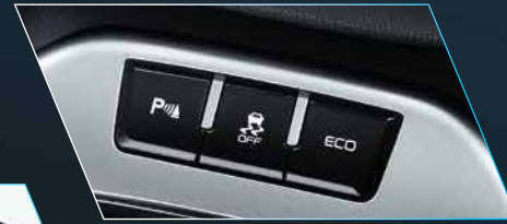
ECO Mode Switch