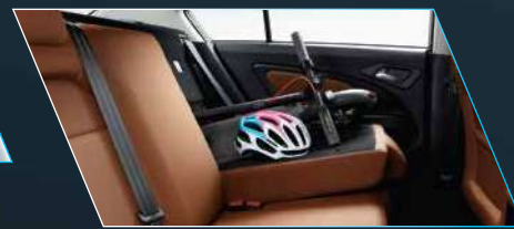
Rear Seat 60:40 Split Fold