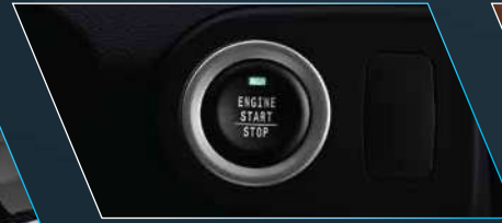
Push Start Button