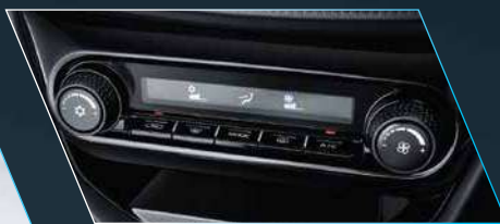
Air-Conditioning with Digital Display