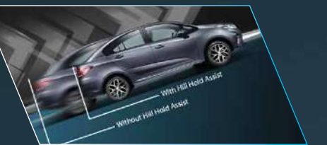
Hill Hold Assist