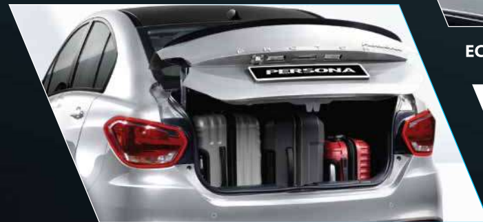
510L Boot Space