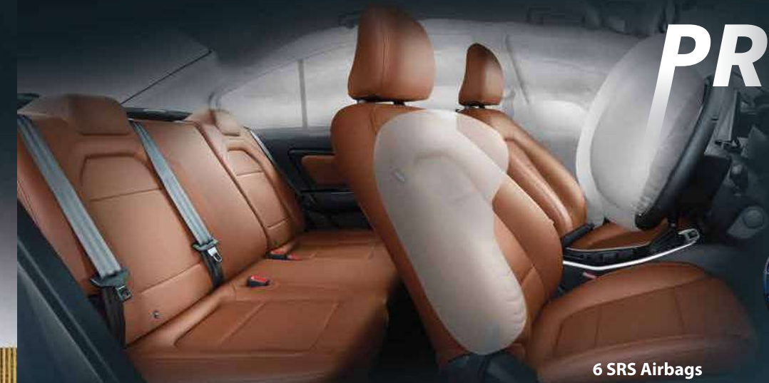
6 SRS Airbags