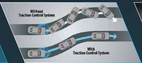
Electronic Stability Control and Traction Control System