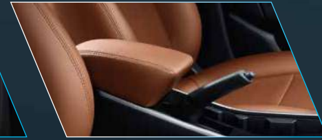
Front Armrest with Console Box