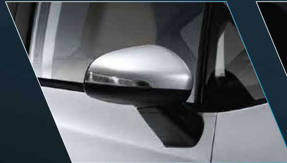
Electric Door Mirrors with Auto Fold Function