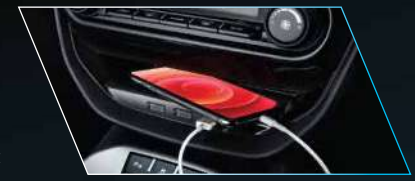
6 USB Ports

Never run out of USB ports; with 3 at the front, 2 at the rear and 1 behind the rear view mirror to power the dash cam.