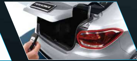
Remote Trunk Release