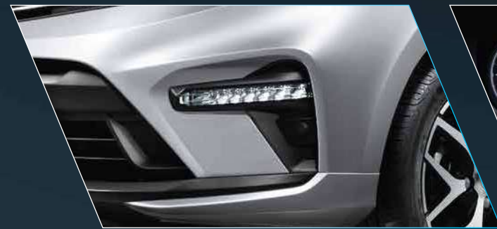
LED Daytime Running Lamps