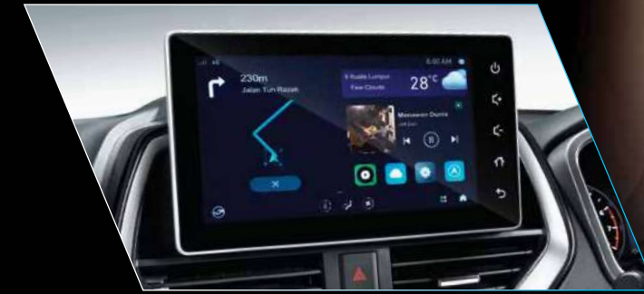
8" Floating Infotainment Head Unit

Offering connectivity that is unmatched by any other vehicle in its class, feel in command as you connect to the PERSONA for communication, navigation and entertainment options.