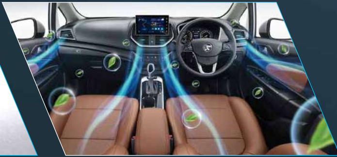
N95 Cabin Filter