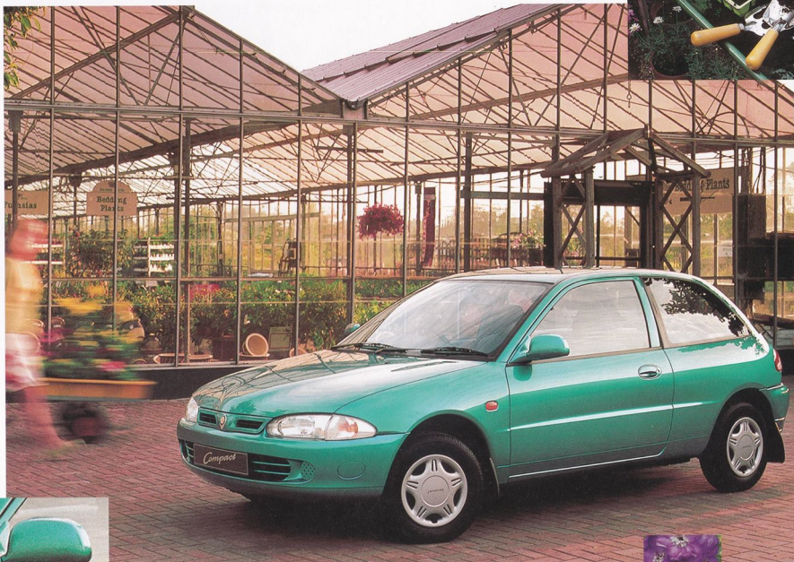
Car shown with optional metallic paint.