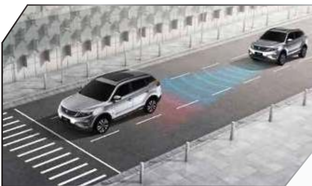
Autonomous Emergency Braking (AEB) and Forward Collision Warning (FCW)

Tuned to provide a safe, comfortable and enhanced NVH driving experience.