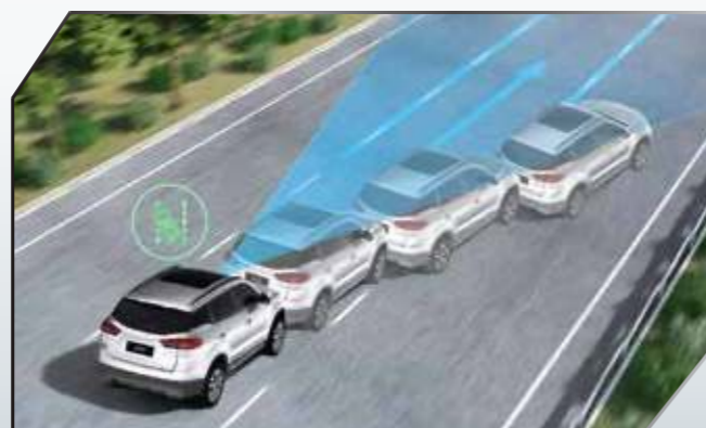
Lane Departure Warning (LDW)

Maintains a safe cruising distance with the vehicle in front regardless of changes in speed.