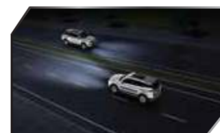
Intelligent High Beam Control (IHBC)

Alerts the driver when the vehicle unintentionally drifts out of the lane.