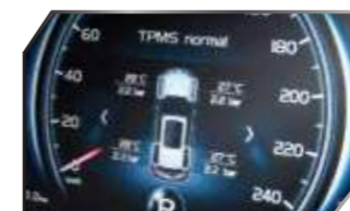
Tyre Pressure Monitoring System (TPMS)

Automatically switches the headlamps between high and low beam when there are oncoming vehicles.