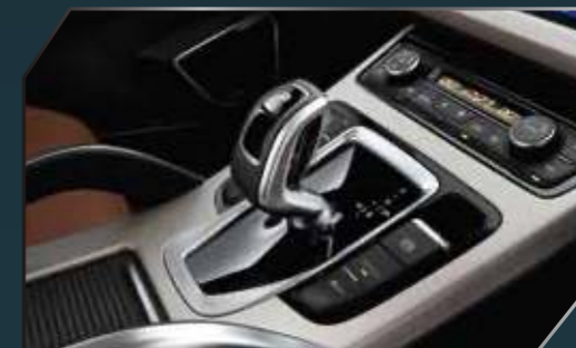
7-Speed Dual Clutch Transmission with Manual Mode

Experience a powerful yet efficient drive with 135kW of power and 300Nm of torque.