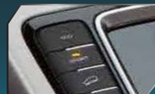
Drive Mode Selection

Offers the best of manual and automatic transmissions for faster, smoother and more efficient gear shifting.