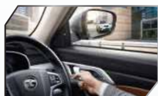
Door Opening Warning System (DOW)

Monitors for blind spots and alerts the driver when vehicles are nearby.