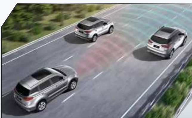
Adaptive Cruise Control (ACC)

Senses potential danger when opening the front doors.