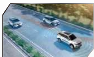
Blind Spot Information System (BLIS)

Equipped with 9 advanced sensors and 5 cameras to look out for what you may miss and react accordingly to keep you and your loved ones safe.