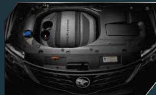
1.5L TGD Engine

Experience a powerful yet efficient drive with 135kW of power and 300Nm of torque.