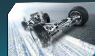
Ride and Handling

Safely retains the brake pressure when stopping at traffic lights or in heavy traffic. Brakes are released by depressing the accelerator pedal.