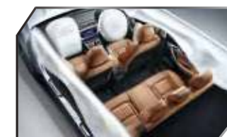
6 SRS Airbags

Provides visual and audible assistance to park with ease.