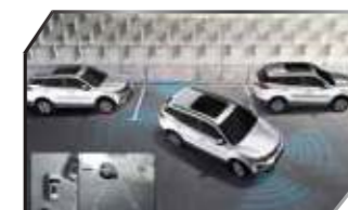
360 Camera and Parking Sensors

Monitors real-time tyre pressure and temperature to provide peace of mind.