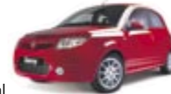
Chilli Red (solid)

So if you love your bargain designer labels, the Savvy will suit you down to the ground. The car's got the right look - bee sting aerial, honeycomb rear light clusters, wide-bore central exhaust. Opt for the Style model and enhance the look with chunky 15" alloys. Inside, you get all those finishing touches you'd expect from a big name - Clarion radio/ CD player, remote central locking, electric front windows (Style only), funky interior styling and more.