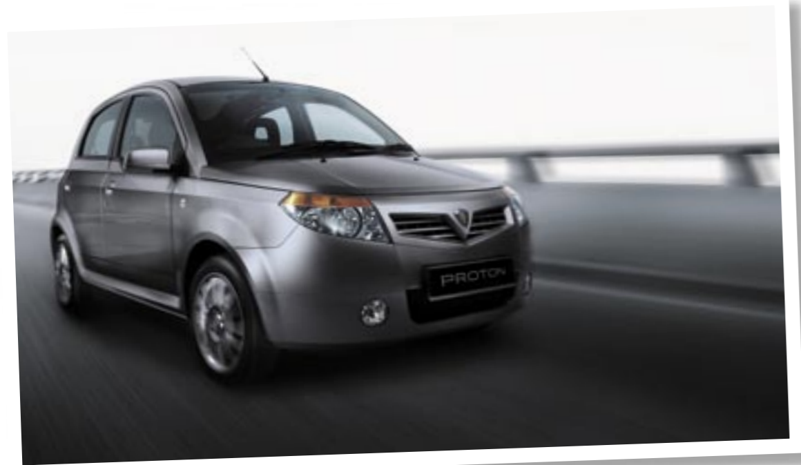
Model shown is Savvy 1.2 Style with optional Steel Grey metallic paint.

So if you love your bargain designer labels, the Savvy will suit you down to the ground. The car's got the right look - bee sting aerial, honeycomb rear light clusters, wide-bore central exhaust. Opt for the Style model and enhance the look with chunky 15" alloys. Inside, you get all those finishing touches you'd expect from a big name - Clarion radio/ CD player, remote central locking, electric front windows (Style only), funky interior styling and more.