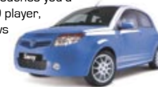
Passion Blue (metallic)

So what will it cost you to look this cool? Less than you might think. And you've got five colours to choose from.