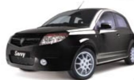
Onyx Black (metallic)