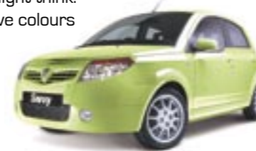
Apple Green (metallic)

So what will it cost you to look this cool? Less than you might think. And you've got five colours to choose from.