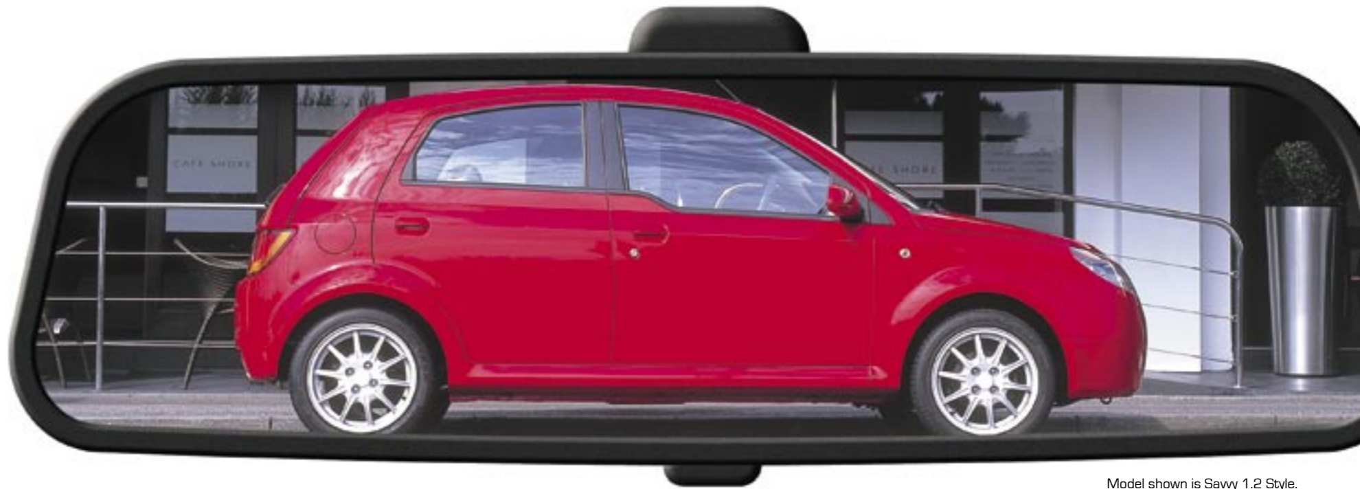
Model shown is Savvy 1.2 Style.

Your car is a big part of your image. It's the thing you put on after your coat when you go into town. But great style doesn't have to break the bank these days. Only rap stars and obscure European royals (the ones you've never heard of in 'Hello' magazine) still pay over the odds for big-name labels. The rest of us shop at those well-known cut-price designer outlets. We get the same stuff as the rap star/royal (delete as applicable) but pay 70% less for it. And we look equally stylish in it. (Not to mention, secretly feeling just a little bit smug.)