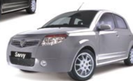
Steel Grey (metallic)