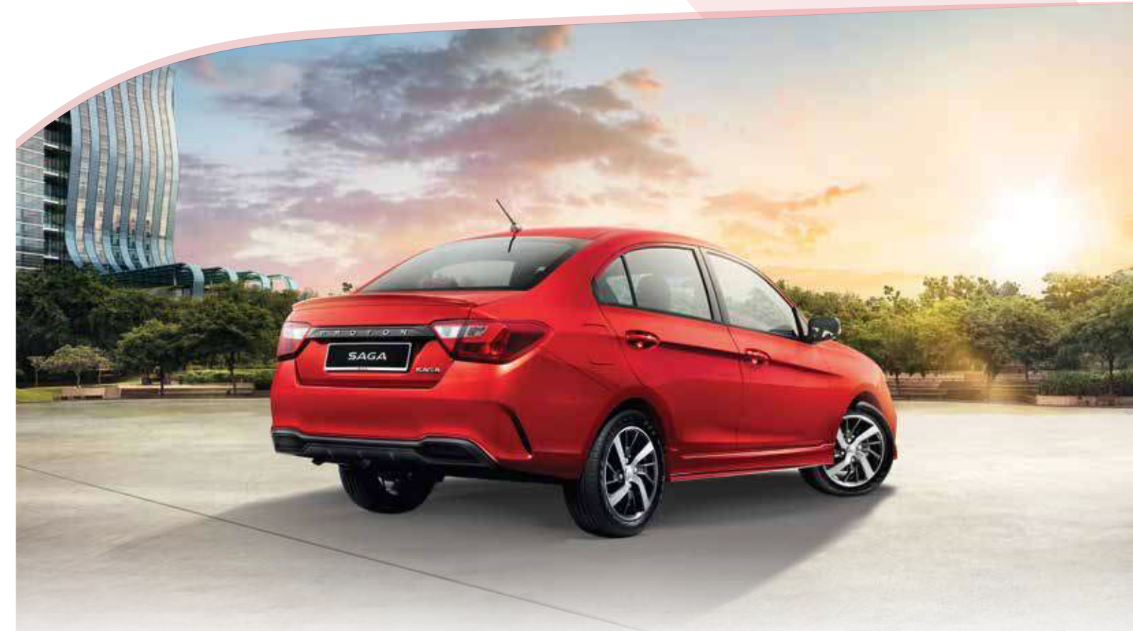
1.3L Premium S AT Semi Leatherette with Fabric

All information detailed in this leaflet is correct at the time of printing. Perusahaan Otomobil Nasional Sdn. Bhd. reserves the right to make changes to the colours, features, and/or other specifications detailed in this leaflet as well as discontinue any individual model without prior notice. The vehicles may differ slightly from those featured in this leaflet. Please consult your PROTON sales outlet to ensure the vehicle is in accordance with your expectations.