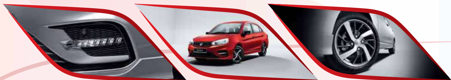
LED Daytime Running Lamps

With features that make your driving experience smoother, you can now turn your attention to the important matter of getting ahead.