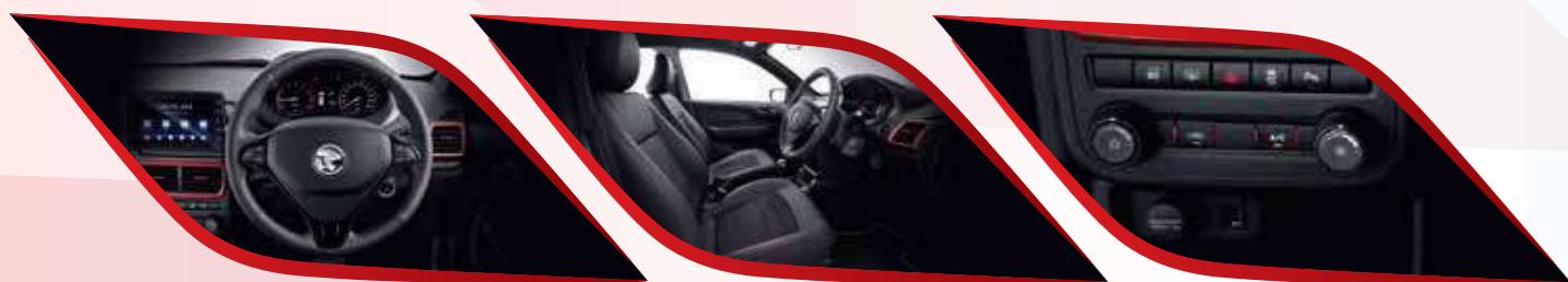
Leatherette Steering Wheel with Switches