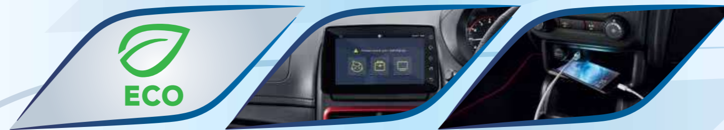
ECO Drive Assist