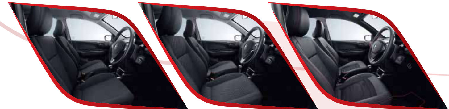
1.3L Standard AT Fabric