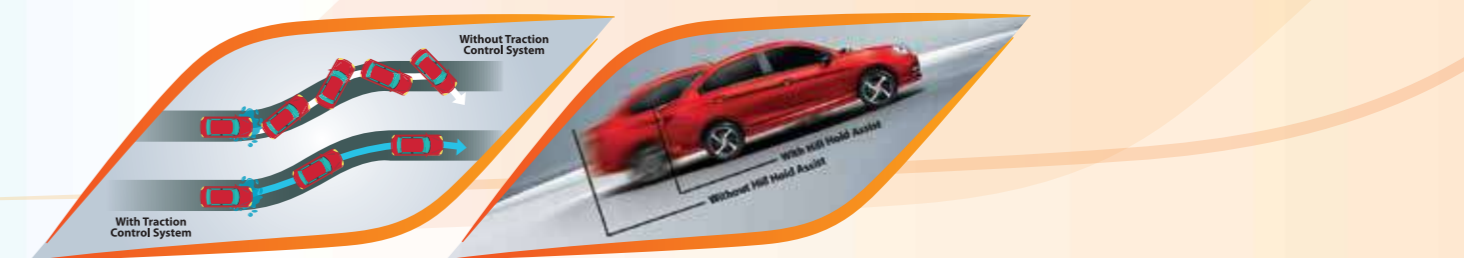
Electronic Stability Control and Traction Control System