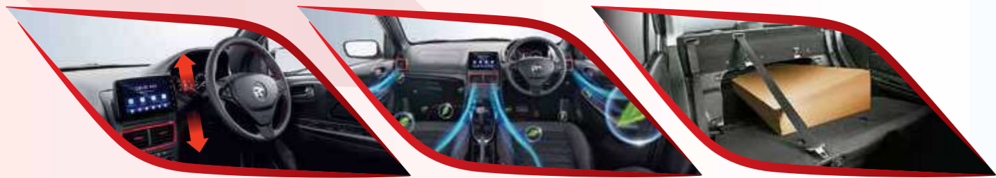
Steering Tilt Adjustment