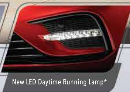
New LED Daytime Running Lamp*