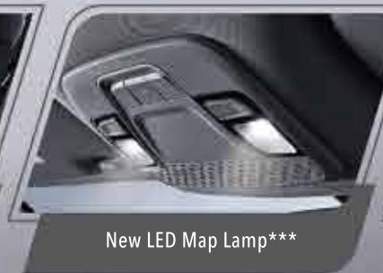
New LED Map Lamp***