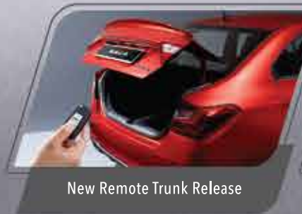
New Remote Trunk Release