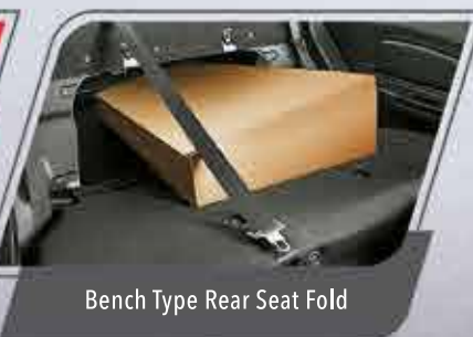
Bench Type Rear Seat Fold