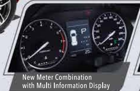
New Meter Combination with Multi Information Display