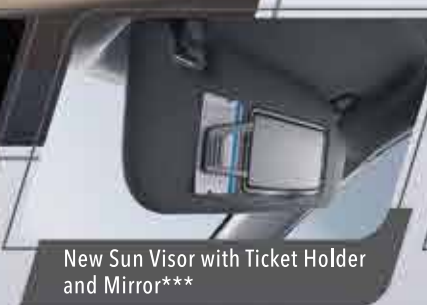
New Sun Visor with Ticket Holder and Mirror***