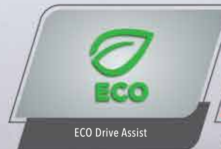
ECO Drive Assist