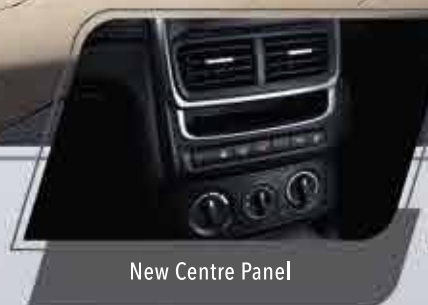
New Centre Panel