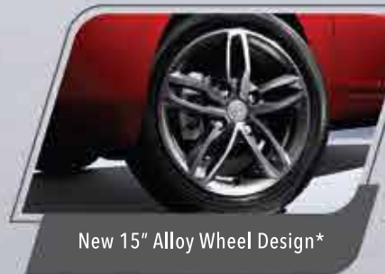
New 15" Alloy Wheel Design*