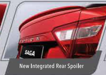
New Integrated Rear Spoiler