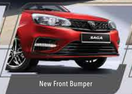
New Front Bumper