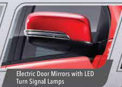
Electric Door Mirrors with LED Turn Signal Lamps