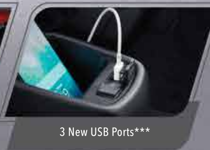
3 New USB Ports***