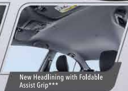
New Headlining with Foldable Assist Grip***