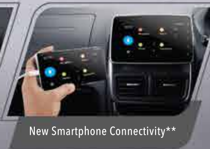
New Smartphone Connectivity**