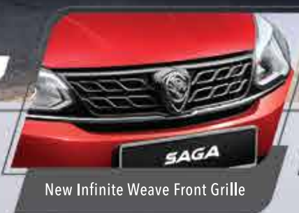
New Infinite Weave Front Grille