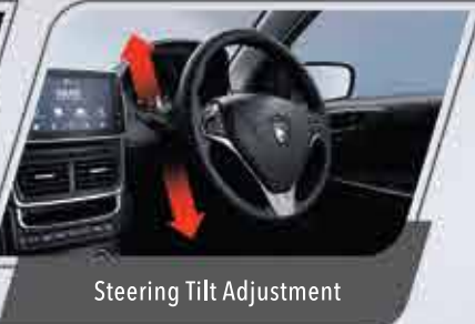
Steering Tilt Adjustment