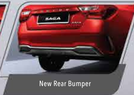
New Rear Bumper