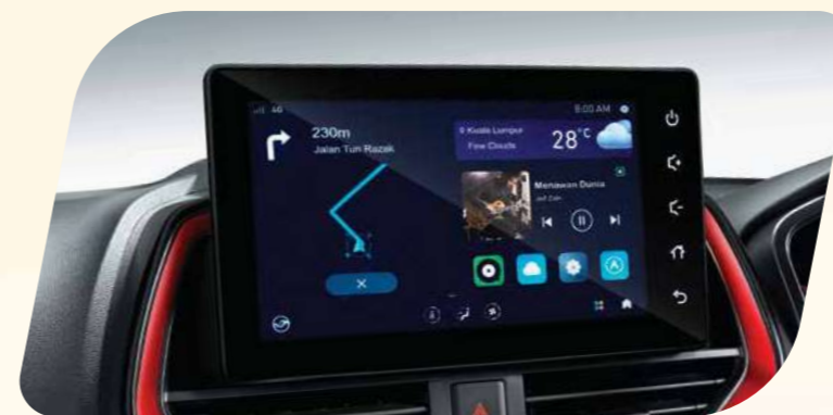
8" Floating Infotainment Head Unit