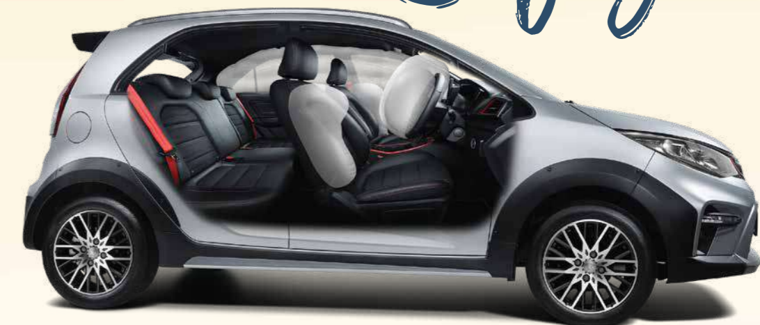
6 SRS Airbags