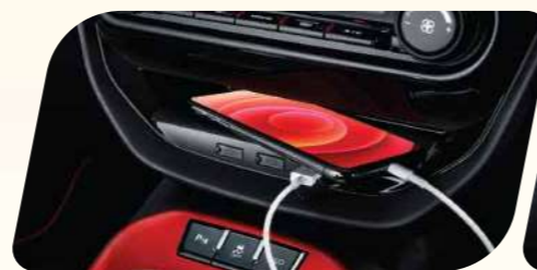
6 USB Ports Never run out of USB ports; with 3 at the front, 2 at the rear and 1 behind the rear view mirror to power the dash cam.