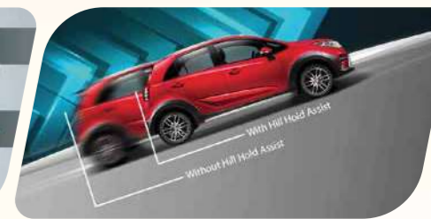
Hill Hold Assist