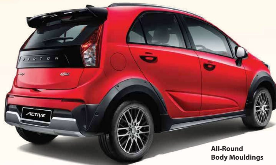
All-Round Body Mouldings