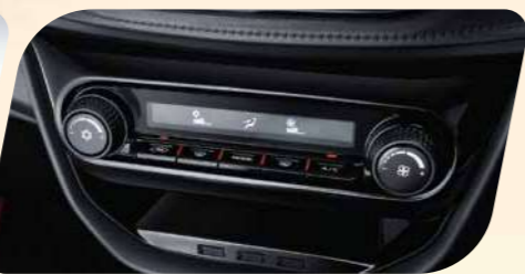
Air-Conditioning with Digital Display