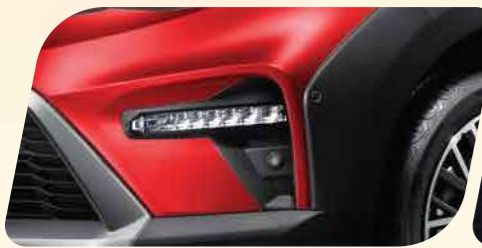
LED Daytime Running Lamps