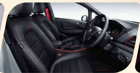
Semi Leather Seats