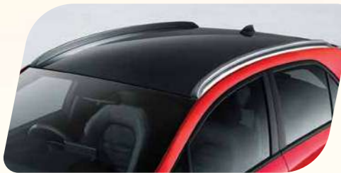
Black Roof with Roof Rails