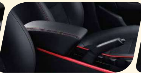
Front Armrest with Console Box