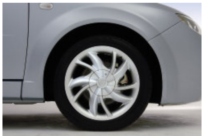
Unique alloy wheels