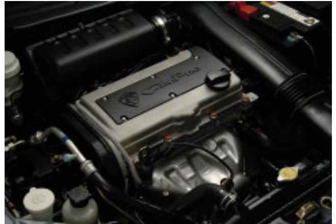
110 bhp CamPro 1.6 engine

The Satria Neo comes in 1.3 and 1.6 litre versions with a five-speed manual or four-speed automatic transmission available on the 1.6 range. So whether you like the ease of an auto or prefer to stir up the gears, the Satria Neo is bound to deliver what you want.