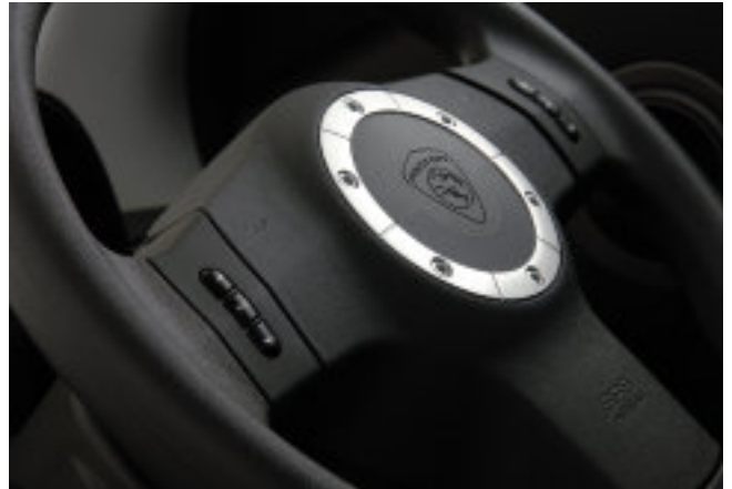
Twin front airbags

Just as importantly, however, it has a strong framework and is built to maximise body rigidity. Together with precision engineering, it means in the event of an accident the force of any impact is distributed throughout the strong and stable frame of the vehicle, dissipating the forces and minimising the risks to the occupants.