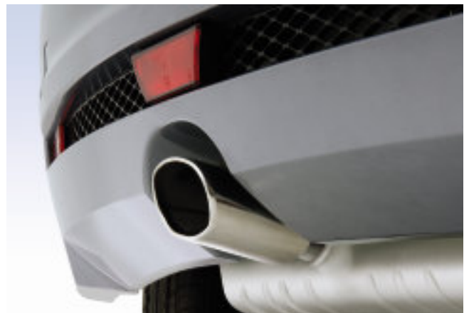
Centre mounted exhaust