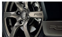
R3 EDITION GUNMETAL ALLOY WHEELS