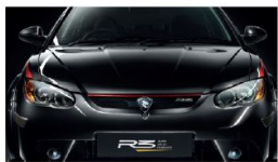
TRANQUILITY BLACK PAINT

Aggressive looks complemented by added aerodynamic efficiency have always been a trademark of R3 vehicles. The Satria Neo is no exception. With race-proven exterior enhancements and track-inspired details, its aggressive stance will provide the ultimate driver involvement.