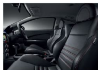
R3 SPORT SEATS

The cabin features a custom colour scheme and dynamic tools for a thrilling driving experience.