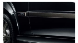
TITANIUM-COLOURED SIDE MOULDINGS