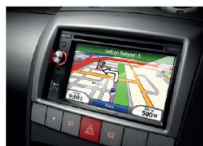
2 DIN MULTIMEDIA WITH NAVIGATION