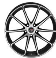
Diamond Cut Finish