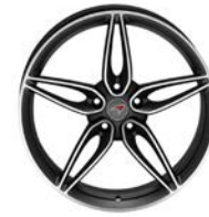
Diamond Cut Finish