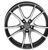
Diamond Cut Finish