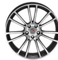
Diamond Cut Finish