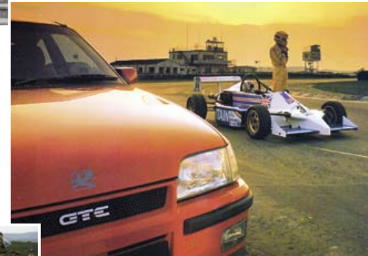
1984 – The MkII Astra introduced class-leading aerodynamic styling that still looks good today. The Formula Vauxhall Lotus ran a modified version of the Astra GTE's 2.0i 16v engine.