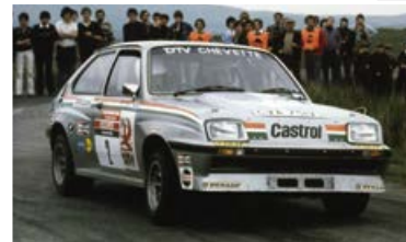
1971 – The formation of Dealer Team Vauxhall (DTV). The track car was the precursor to our enormous success in touring car racing.