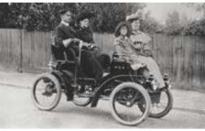
1903 – Forward thinking has been in our nature from the very start. The 6HP, our first ever car, had two forward gears. And no reverse.