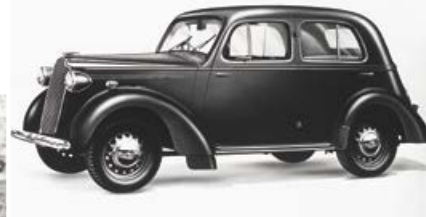
1937 – The Vauxhall 10' H-type, the first British car to have integral construction.