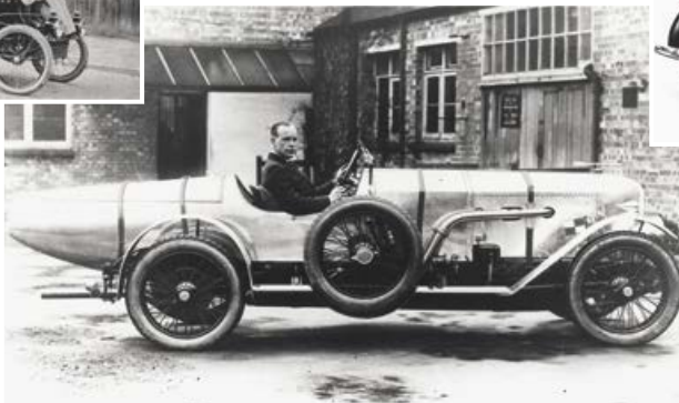
1922 – The Silver Arrow OE 30-98 was capable of speeds of over 100mph, this model was built for shipping magnate Sir Leonard Ropner to race at Brooklands.