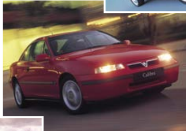
1990 – The Calibra was the world's most aerodynamic production car.