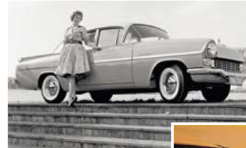
1957 – The PA Cresta introduced Americana styling to the UK.