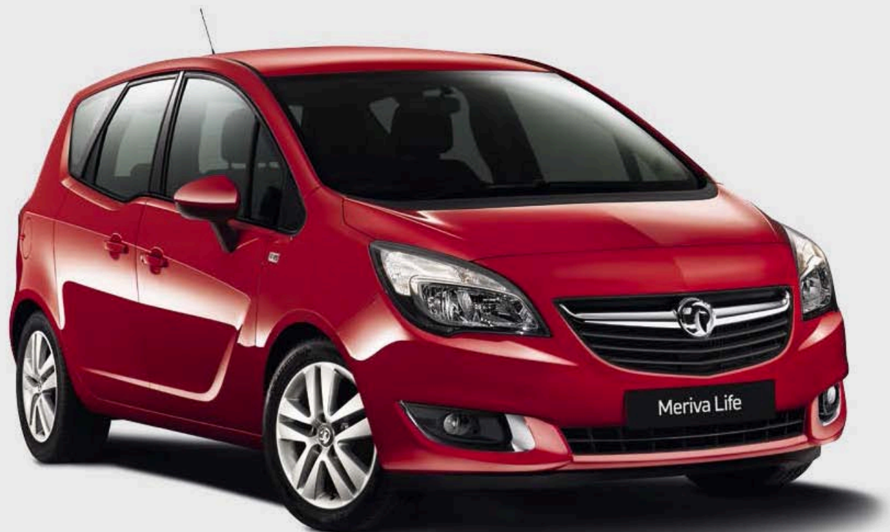
Flame Red solid paint.