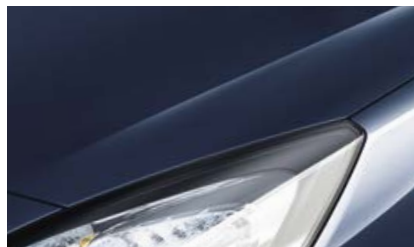
Dark Sea Blue