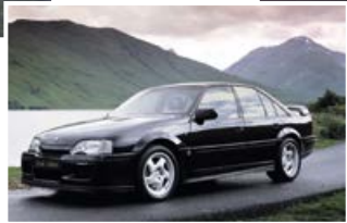
1989 – The Lotus Carlton was the world's fastest production four-door saloon.

Scan this QR code with your smartphone for more information on the last 110 years of Vauxhall innovation. Don't forget to download a QR reader from your app store first.