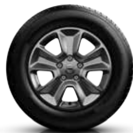
16" 'Tyrol' alloy wheels