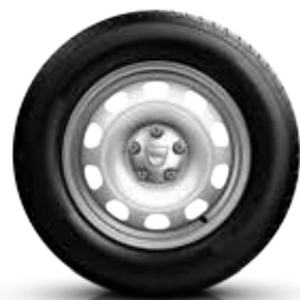
16" 'Eiger' steel wheels