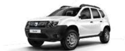
Glacier White (369)