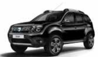
Pearl Black (676)