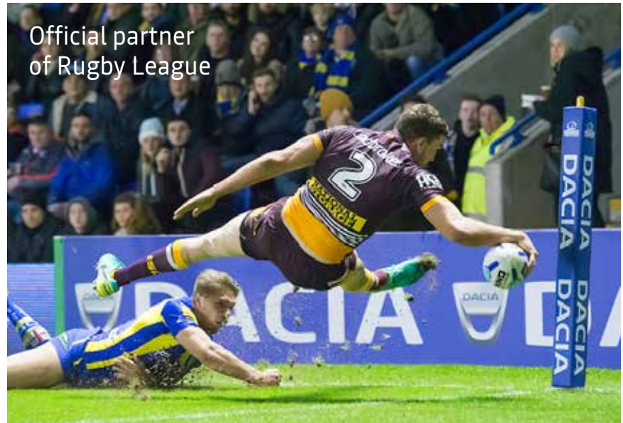
Official partner of Rugby League

For us, putting in the extra mile doesn't stop at making great value cars. We take great pride in playing an active part in the community and giving back to communities throughout the UK. We support the life-saving work of the Nationwide Association of Blood Bikes . We get stuck in as the official partner of Rugby League . We also run an annual Dacia Day , full of fun and games for our amazing Dacia drivers – maybe we'll see you there next year? In the meantime, keep up with us on our Facebook page or Youtube Channel.