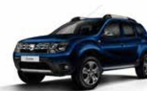
Cosmos Blue (RPR)