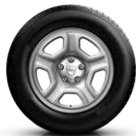
16" 'Sierra' steel wheels