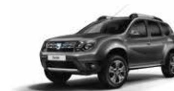
Slate Grey (KNA)