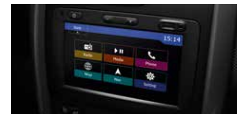
MediaNav - standard on Lauréate only