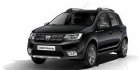
Model shown is a Sandero Stepway Lauréate in Slate Grey