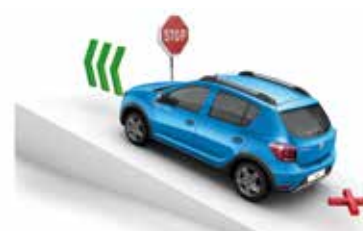
Hill Start Assist