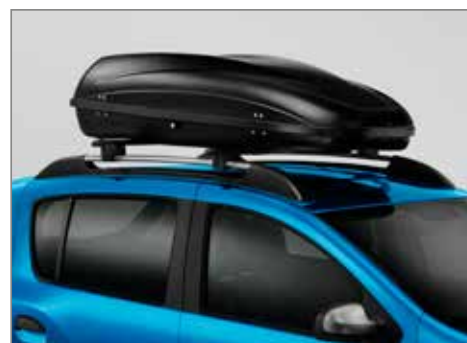
Roof box (400L)