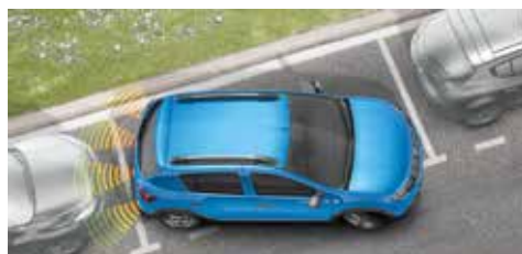
Rear parking sensors - standard on Lauréate only