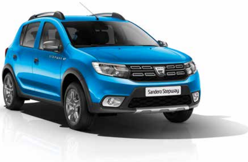
Model shown is a Sandero Stepway Lauréate in Azurite Blue

* Figures are obtained for comparative purposes in accordance with EU Legislation and may not reflect real life driving results.