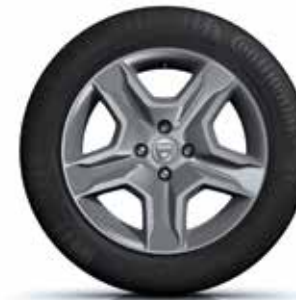
16" 'Stepway' design wheels